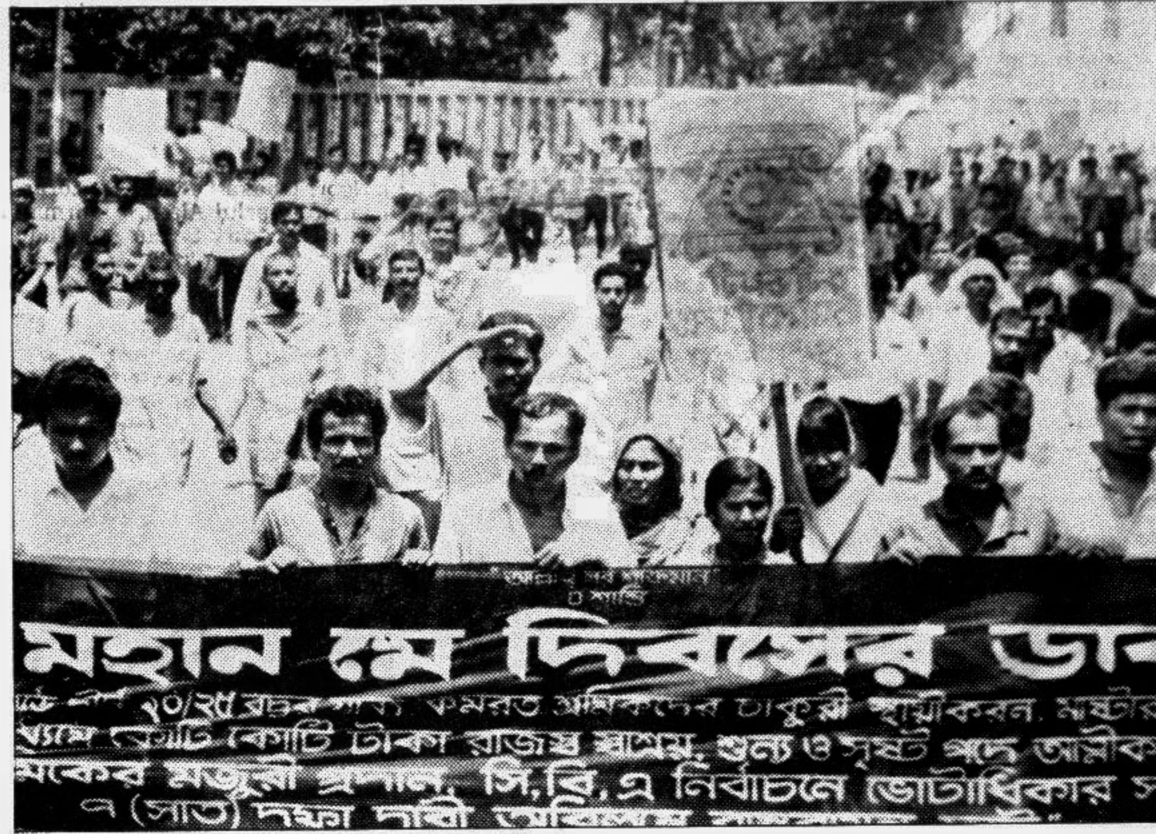
Bangladesh Telecommunications Casual Workers and Employees Association brought out a rally in support of its 7-point demand in the city on the occasion of May Day Thursday.

The annual report, an overview of infringements of press freedom in 149 countries, is divided in five chapters, one for each world region — Africa, the America, Asia and the Pacific, Europe and the former Soviet Union, and North Africa and the Middle East.