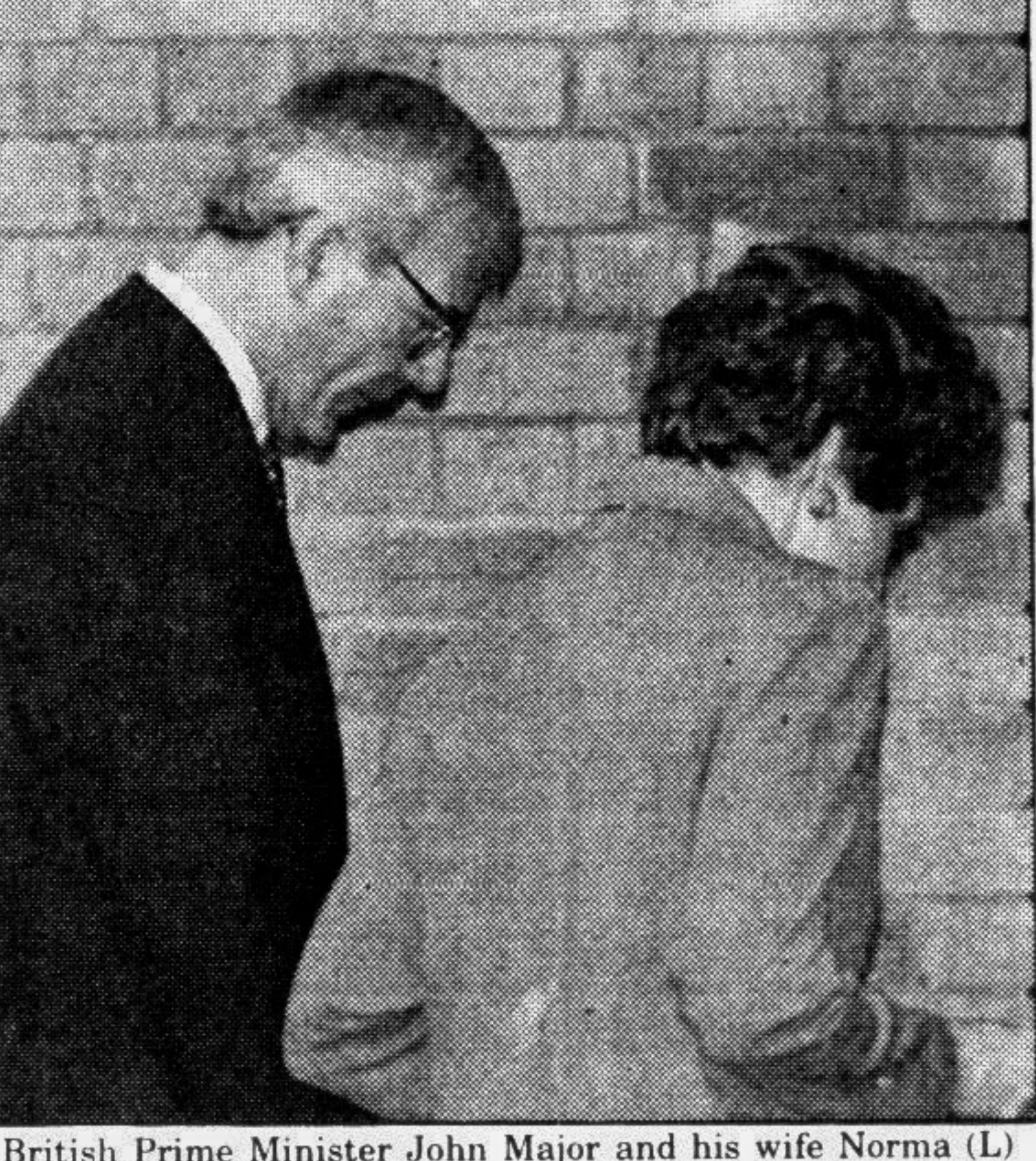
British Prime Minister John Major and his wife Norma (L) leaves the counting center yesterday in Saint Ives in his constituency after the announcement of the general election results.

Final standings LONDON, May 2: Following is a final breakdown of the number of parliamentary seats each party won in Britain's election and the share of votes each polled, according to Reuters. Conservatives . . . . . 165 (165 held, 178 lost) Labour . . . . . 419 (273 held, 146 gained) Liberal Democrats . . . . . 46 (18 held, 30 gained, 2 lost) Others . . . . . 29 (19 held, 8 gained, 4 lost) Average swing to Labour from Conservatives — 10.2 per cent majority for Labour — 179. Share of the vote — Labour 45 per cent, Conservatives 31 per cent, Liberal Democrats 17 per cent.