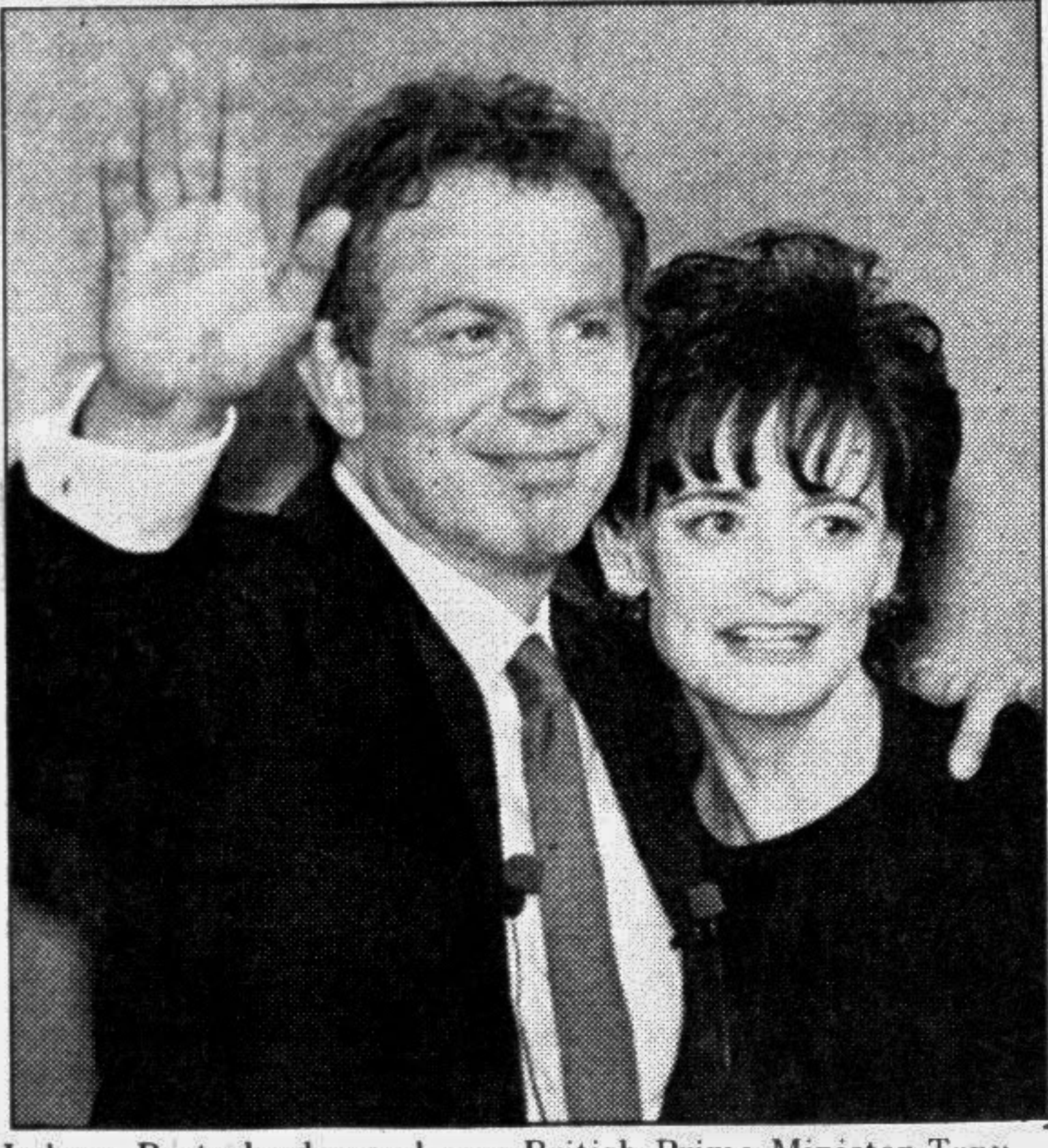
Labour Party leader and new British Prime Minister Tony Blair and his wife Cherie wave at party workers and supporters after their arrival at the Royal Festival Hall for a post-election celebration early yesterday

LONDON, May 2: Tony Blair became Britain's youngest prime minister in 185 years today after his Labour Party crushed the Conservative Party which had been in power for 18 years, reports AP. The Tories had been expected to lose but the scale of their defeat surprised both politicians and the public: It was the worst Conservative trouncing since 1832 and Labour's biggest election triumph ever. Prime Minister John Major went to Buckingham Palace to