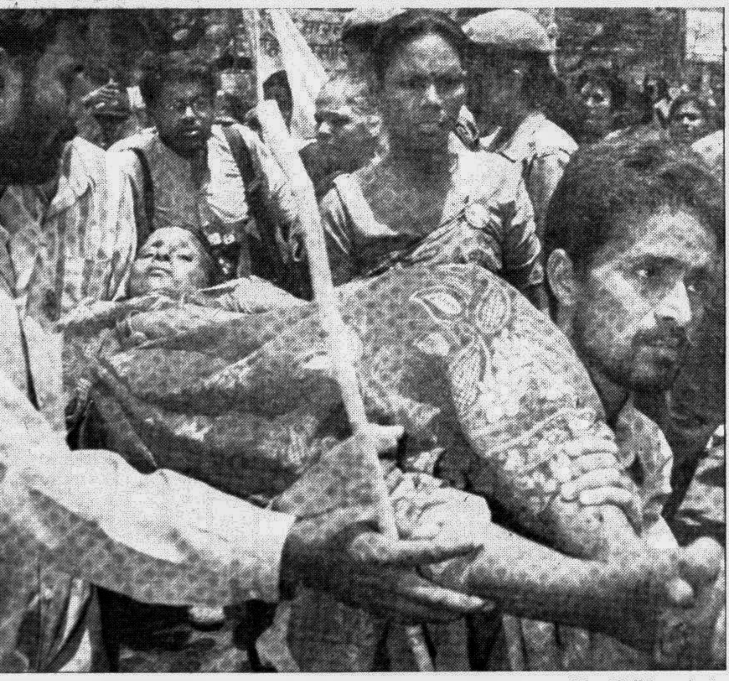
An injured woman being carried from the scene of a protest yesterday in New Delhi against Bihar Chief Minister Laloo Prasad Yadav, named in a massive corruption scandal. The woman was injured when police used water canon to disperse the protestors.