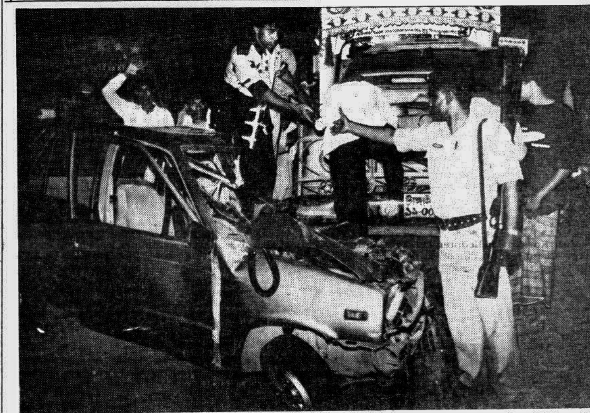
A speeding truck rammed a private car on Dhaka-Gazipur highway yesterday killing the driver on the spot.

It observed that in the prevailing system, there is no effective interaction between the parents and school management. It, therefore, laid emphasis on developing a rapport between the school authorities and parents.