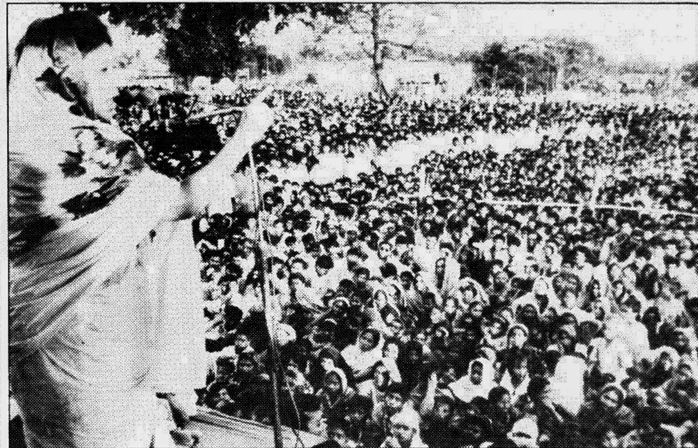
BNP chairperson and Leader of the Opposition in Parliament Begum Khaleda Zia addressing a public meeting at Garuhata field at Gafargaon in Mymensingh yesterday.

From Our Correspondent RAJSHAHI, Apr 29: The strike called by the Islami Chhatra Shibir (ICS) in Rajshahi University protesting the new admission system was observed partially today. Some offices on the campus were open and the ongoing examinations were held as scheduled. But the distribution of application forms for admission remained suspended for fourth day today as the Agrani Bank branch did not function. A heavy contingent of police was patrolling the campus. Except the explosion of a cocktail, no untoward incident was reported during the hartal. Most of the students, except ICS supporters, returned to the campus. Meanwhile, 40 students, out of 125 arrested on Sunday night, were released from the Rajshahi Central Jail on bail today. See Page 12 Col 2