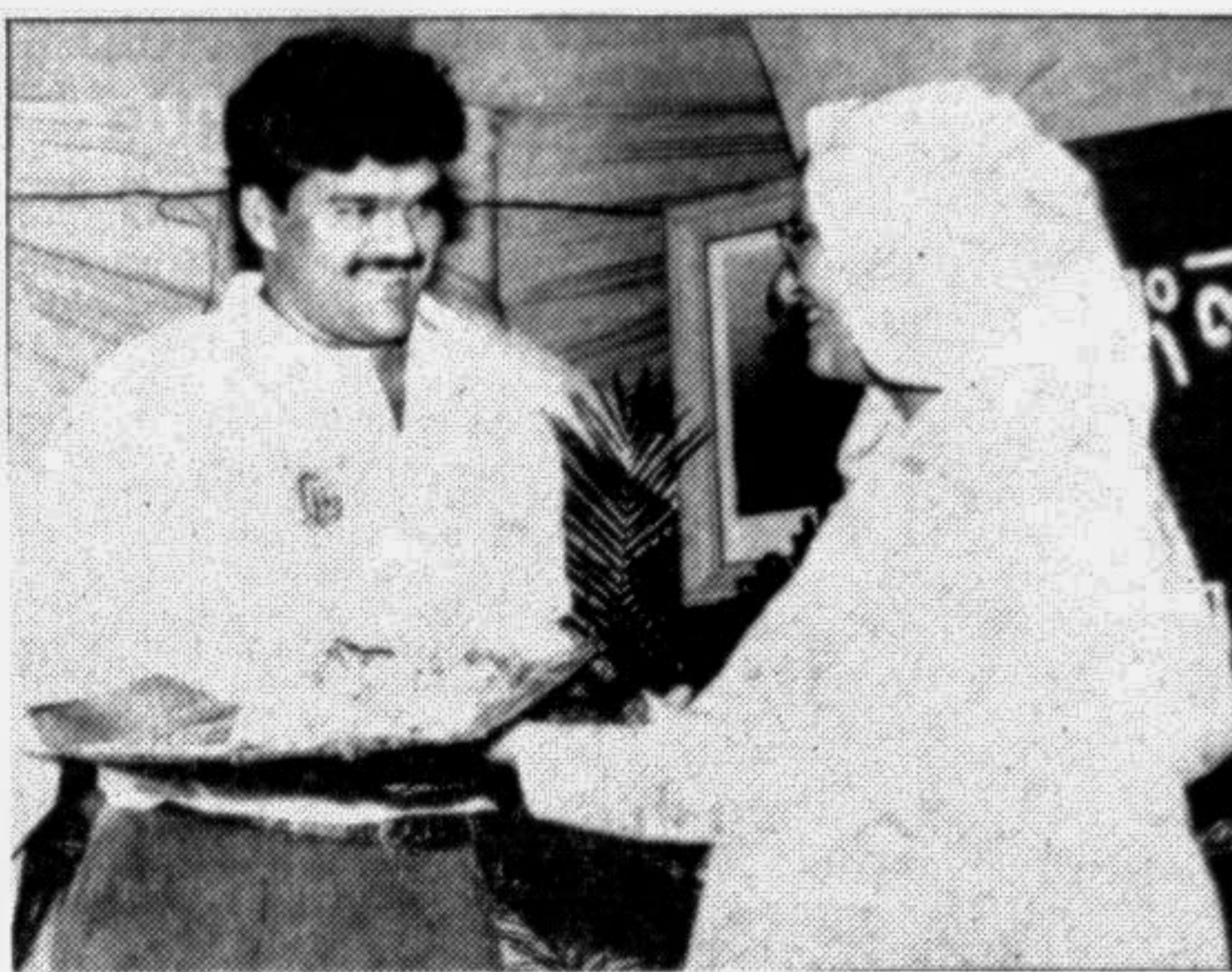
Prime Minister Sheikh Hasina presenting bouquets to the members of the ICC Trophy winning Bangladesh cricket team at a function organised by the National Sports Council at the official residence of State Minister for Sports Obaidul Kader yesterday.

Talking to this correspondent, a number of DSE members present at the office expressed dissatisfaction over the prevailing chaotic situation in the country's capital market.