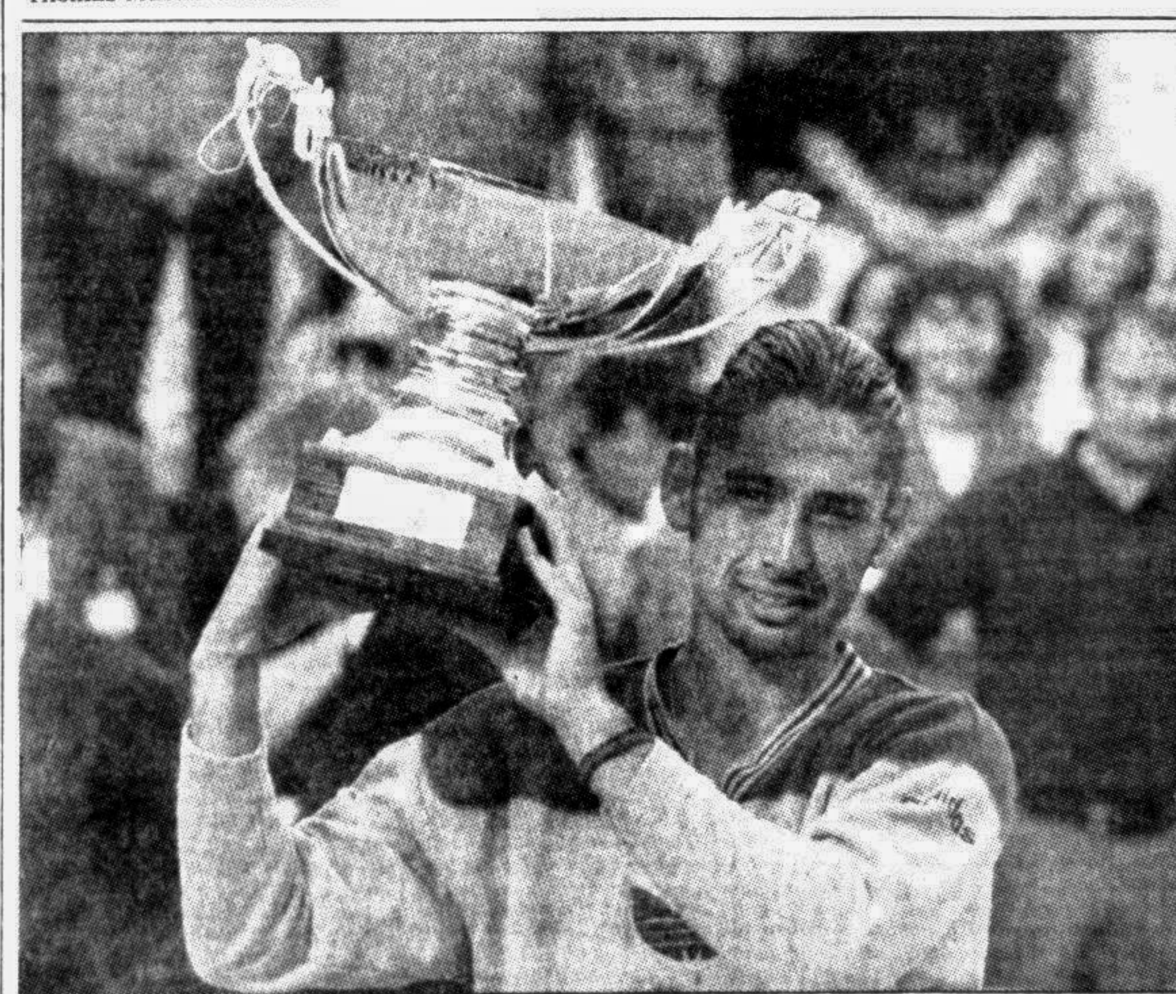
Marcelo Rios of Chile shows off the Monte Carlo Open Trophy. The Chilean clinched the title beating Spaniard Alex Corretja 6-4, 6-3, 6-3 in the final on Apr 27.