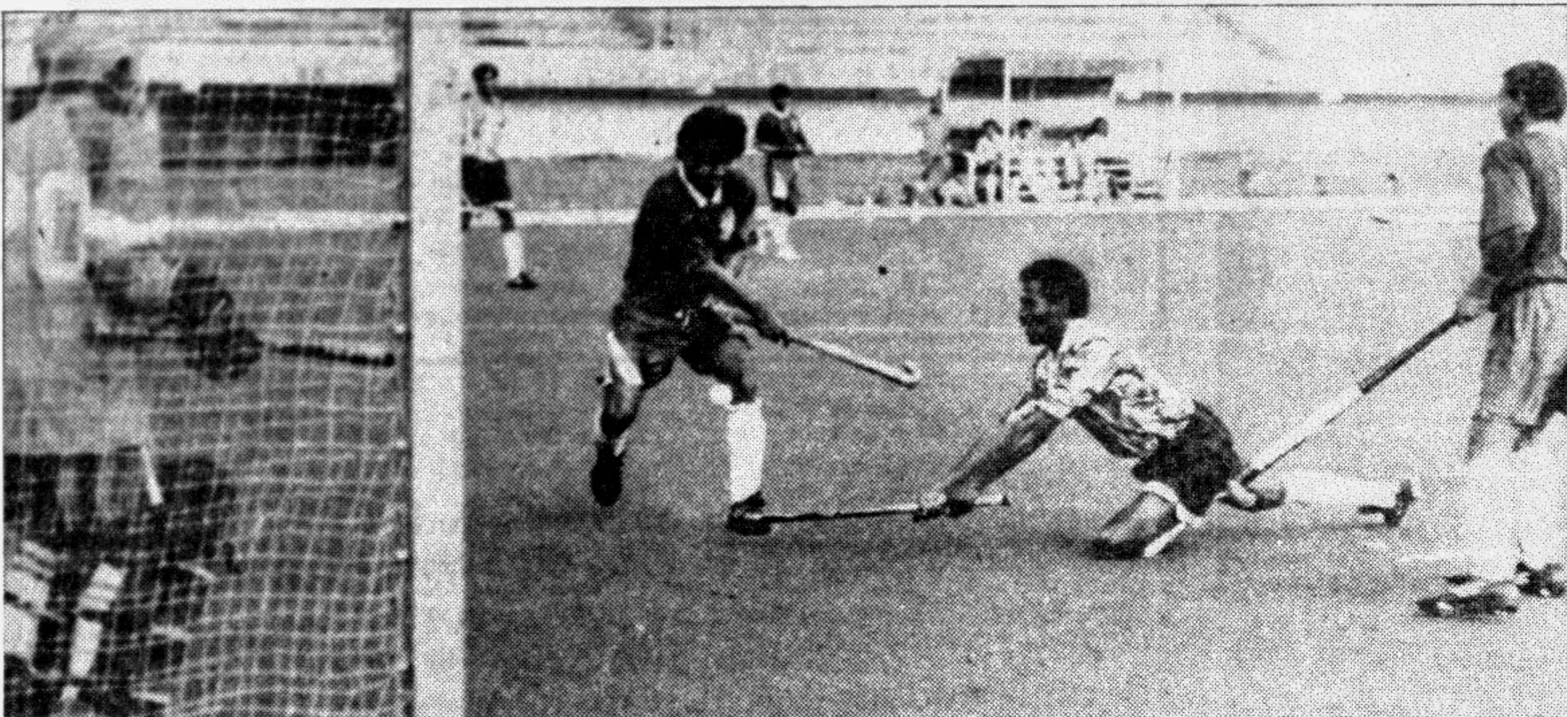
Action from the opening match of the Green Delta First Division league between defending champions Mohammedans and Victoria SC at the National Hockey Stadium yesterday. The holders won 5-0.