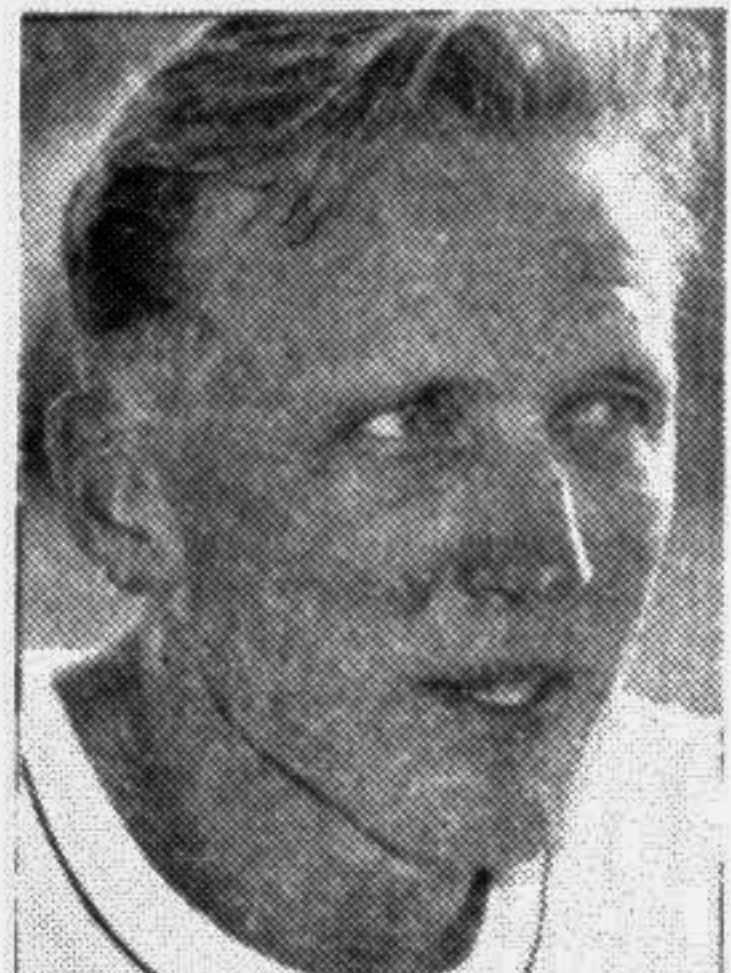
Allan Donald. (South Africa's fast bowler) "The game has changed, the batsmen go after the new ball." (On bowlers' disadvantageous position in modern cricket)

✓ Tick the Correct Answers Competition closes 8 pm, May 2, '97