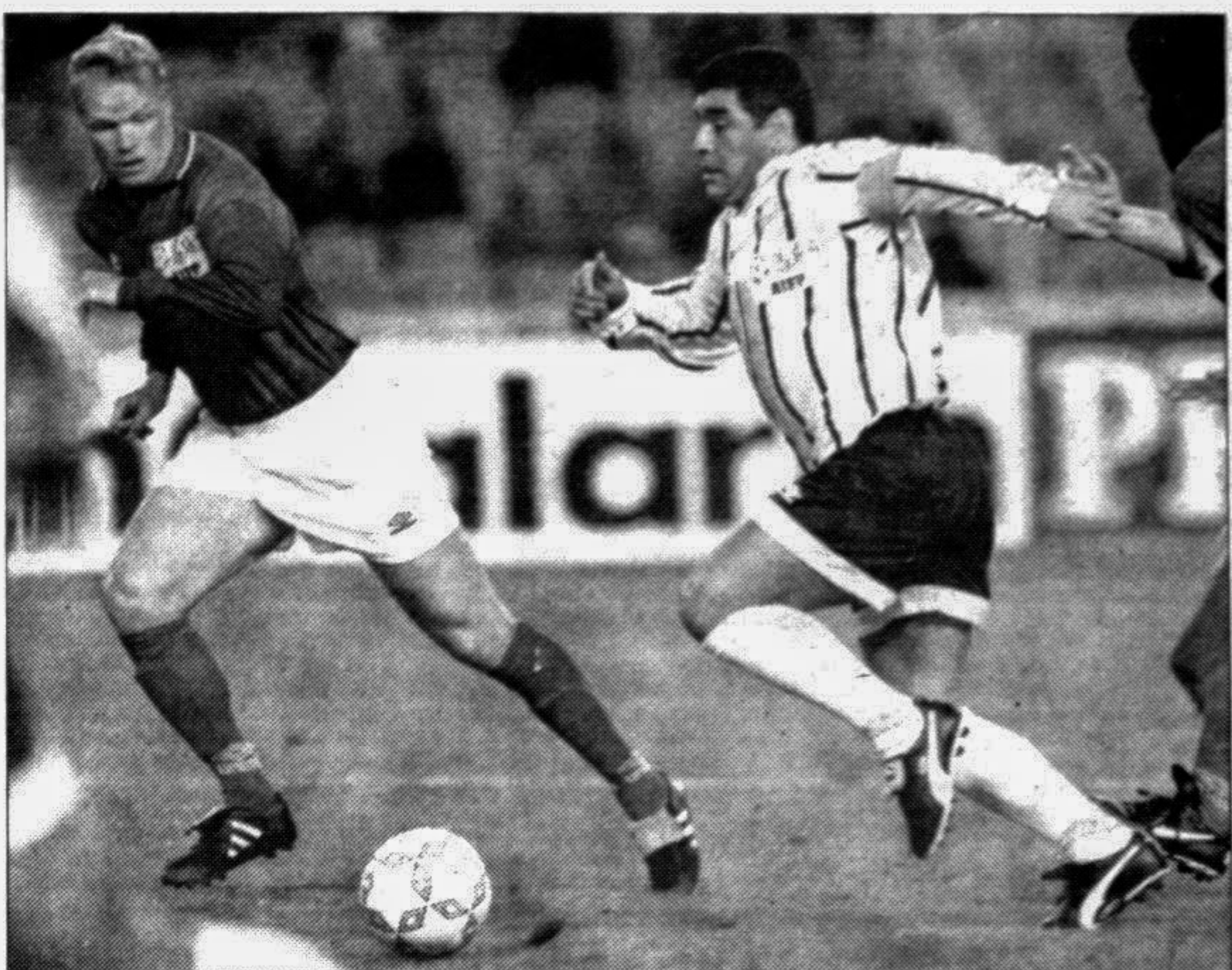
Argentine Diego Maradona (R) of the Rest of the World XI and Dutch Ronald Koeman of Europe XI are in quest of the ball during their friendly match at the Olympic Stadium in Barcelona on Apr 27. The World side won 4-3.