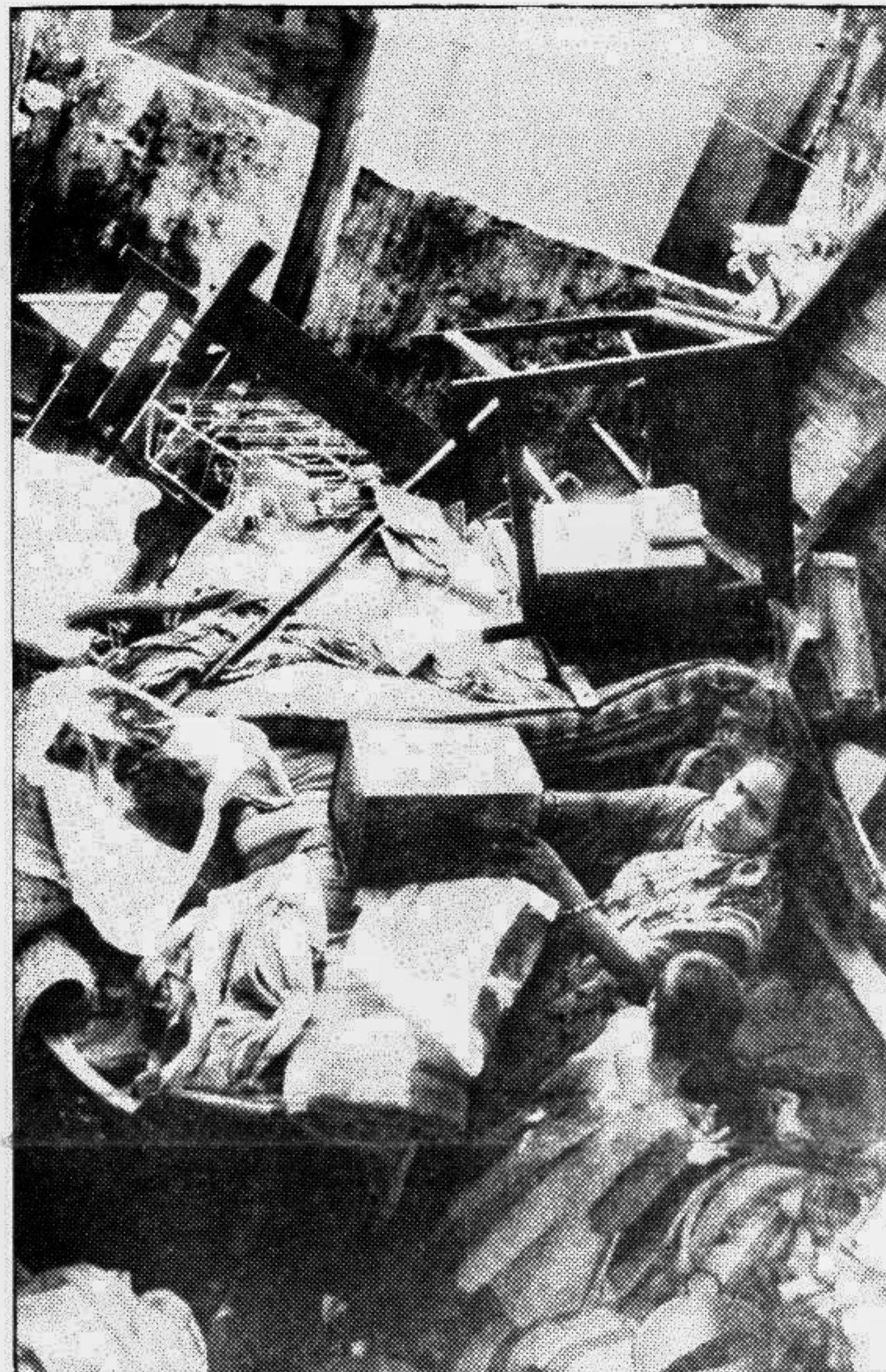
Some unidentified miscreants ransacked a house at Laxmibazar under Sutrapur thana in the city yesterday.

The central bank governor See Page 12 Col 3