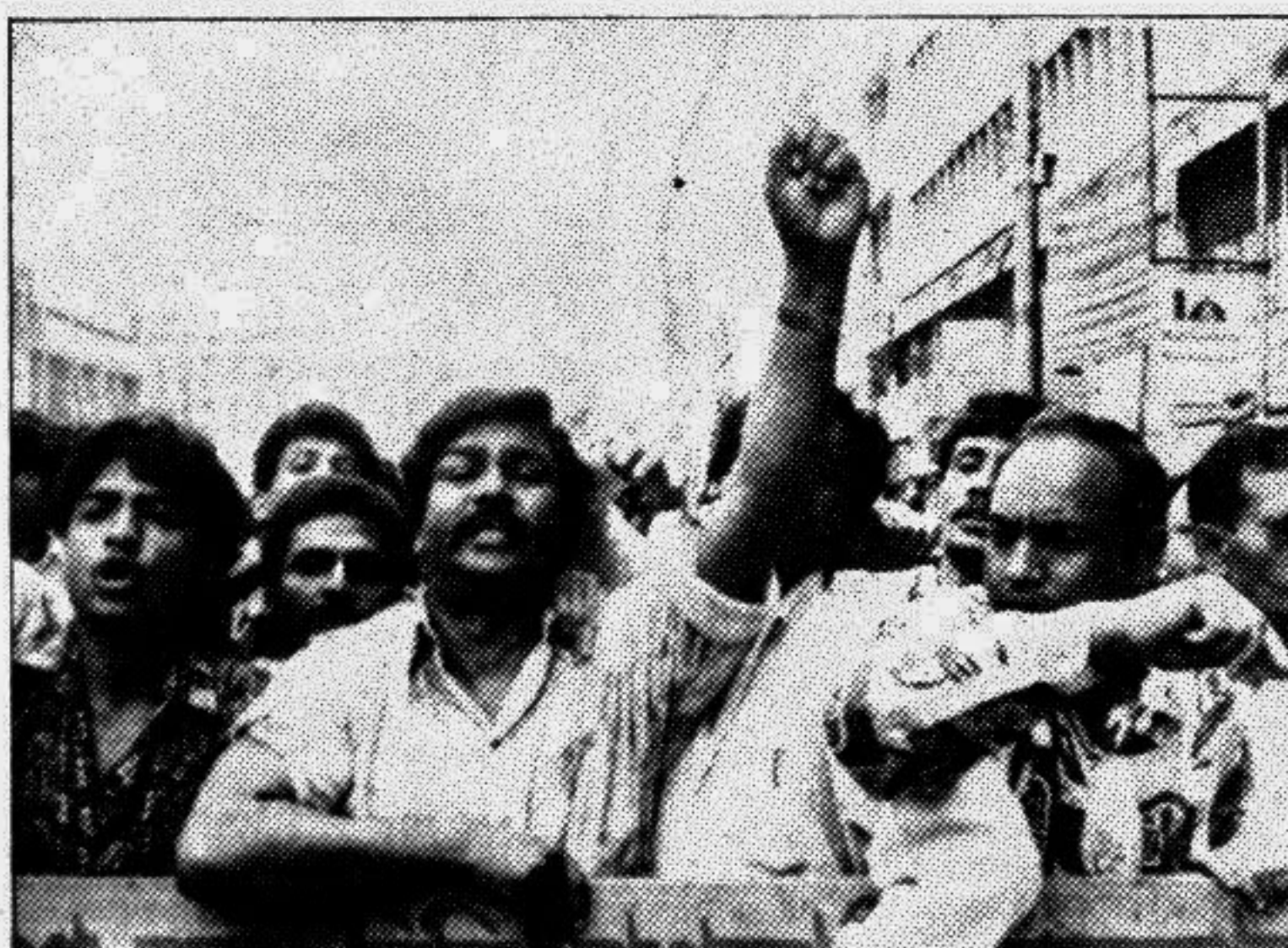
Kerb market share traders demonstrating in front of the DSE building in the city yesterday.