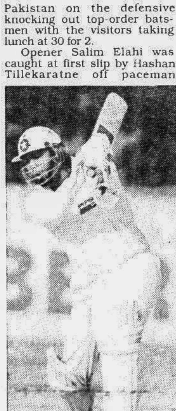
INZAMAM ... 43 n.o.