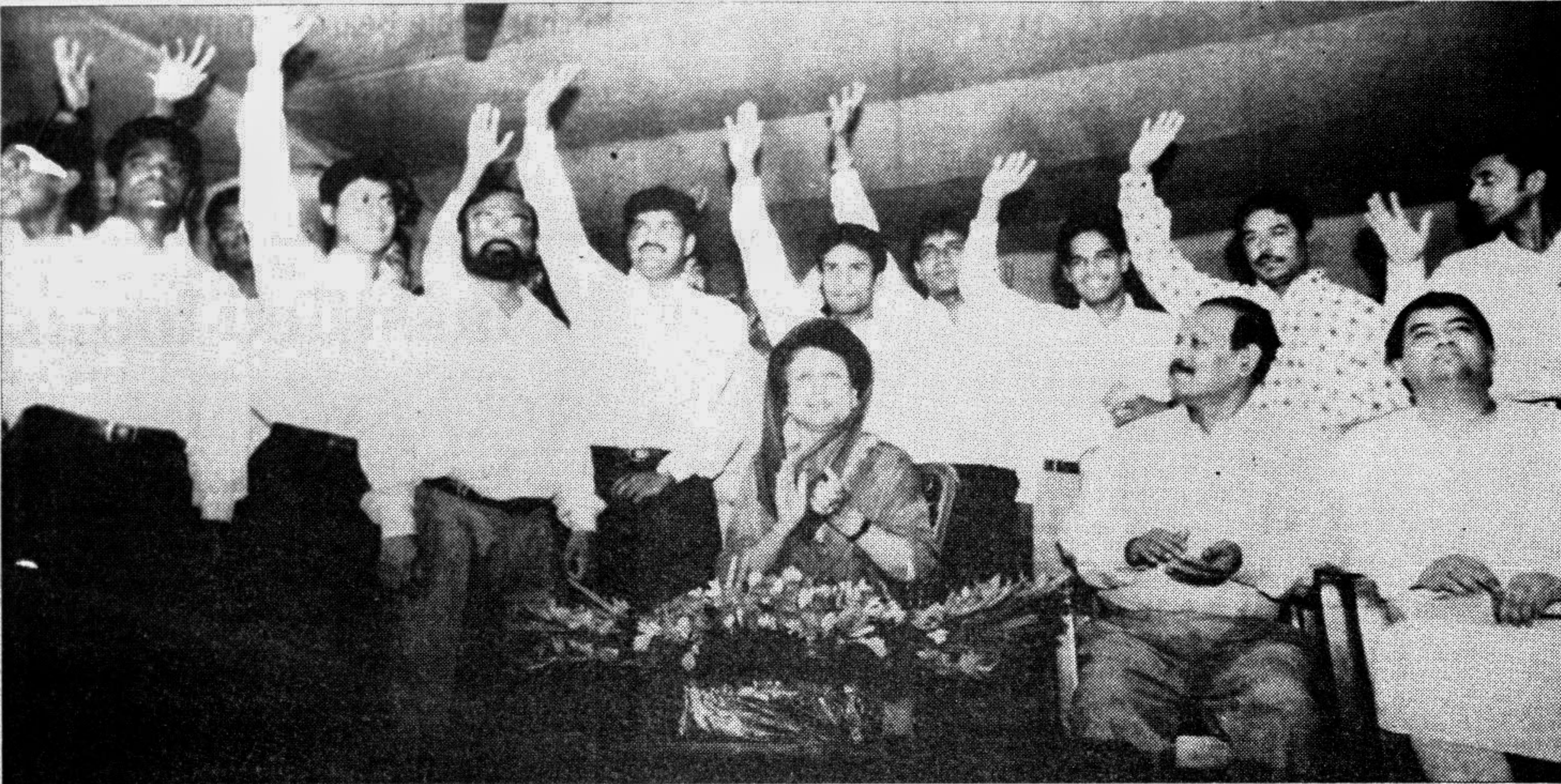
Leader of the Opposition and BNP chairperson Begum Khaleda Zia welcomes members of the Bangladesh ICC Trophy-winning team at a reception hosted by her party in the city yesterday.