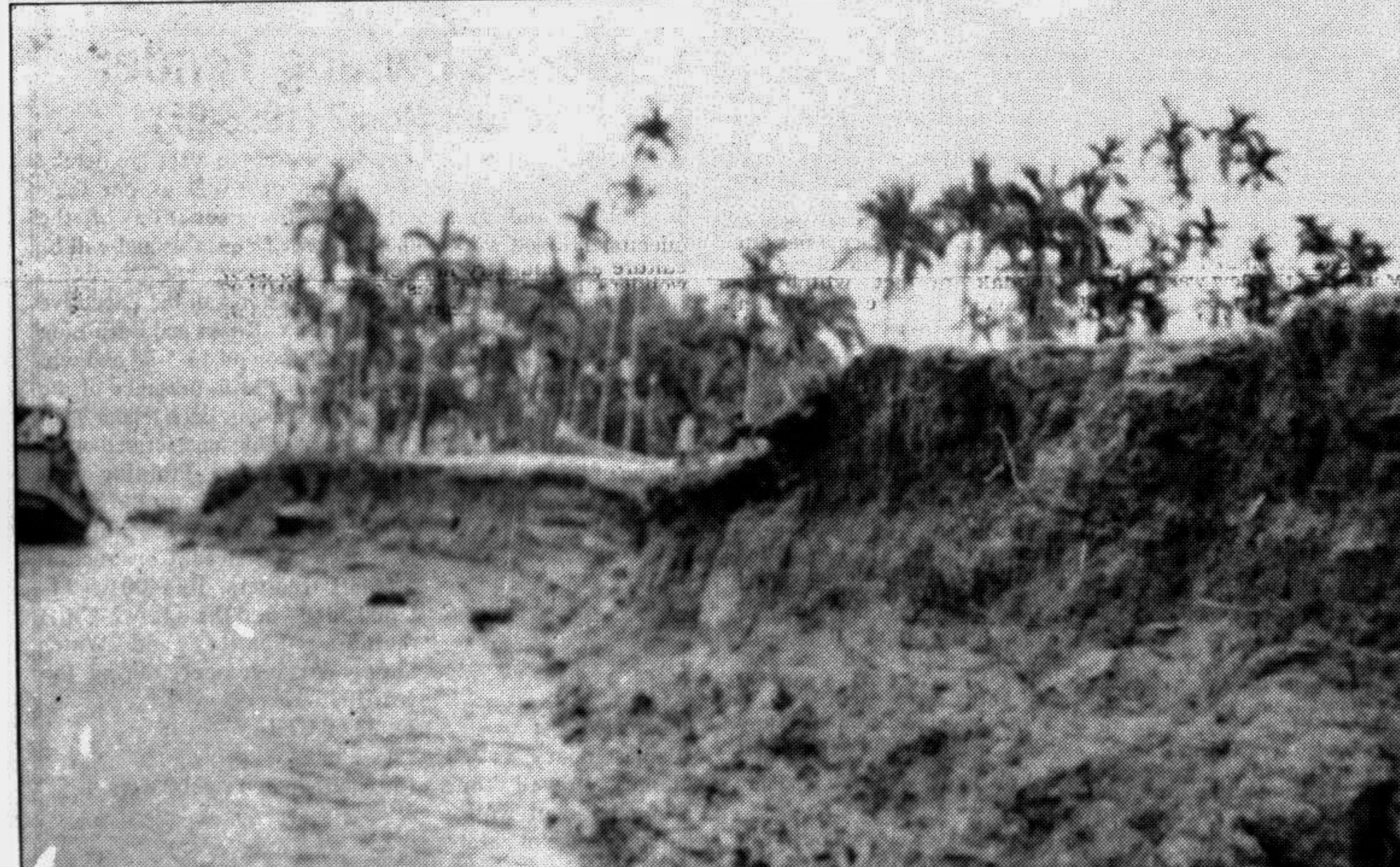
BARISAL: Continuous river erosion in Sreepur Bandar area of Mehendiganj thana in the district rendering thousands of people homeless.

Nazirpur, Kankhali, Bhandaria thana areas of Pirojpur district are also on the continuous threat of erosion of Sandhya, Sugandhya, Bishkhali, Baleswar, Andhar Manik, Ilisha, Kacha and Meghna rivers. In Barisal, people of Charkana areas are badly affected by the erosion of Kirtonkhola river. More than five hundred shops and houses including three industrial units are threatened by the continuous erosion of Tulatali river at Bakerganj thana area of Bhola district. At any time huge area along the riverside may be devoured in the river along with all these establishments, local people said. It may be recalled that erosion of this Tulatali river is continuing for years.