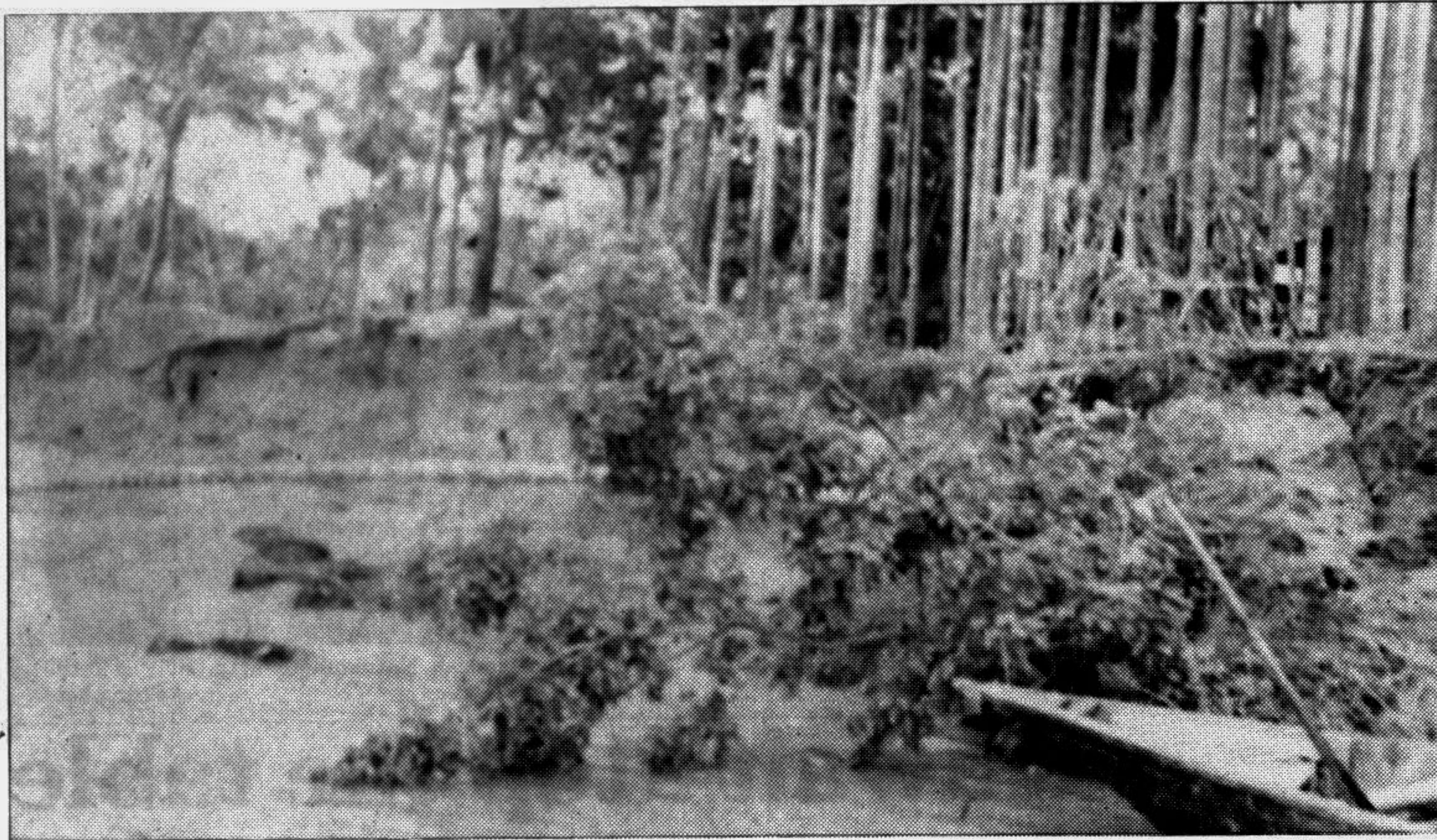
BARISAL: Erosion of the river Tulatali in Bakerganj is going on unabated.

BARISAL, Apr 27: Erosion of different river banks in the southern districts is going on unabated for a longtime. Several hundred business establishments, educational institutions, shops and bazzars, dwelling houses including several thousand acres of cropland have already been engulfed and devoured in these rivers in different districts of southern region. Thousands of shelterless people who took refuge at the riverside or roadside embankments, slums in charlands near the town areas are helpless as they have already become almost beggars. Almost throughout the year, erosion continues in the rivers of Meghna, Tetulia, Sugandhya, Sandhya, Paira, Bishkhali, Ilisha, Kirtonkhola, Kacha,