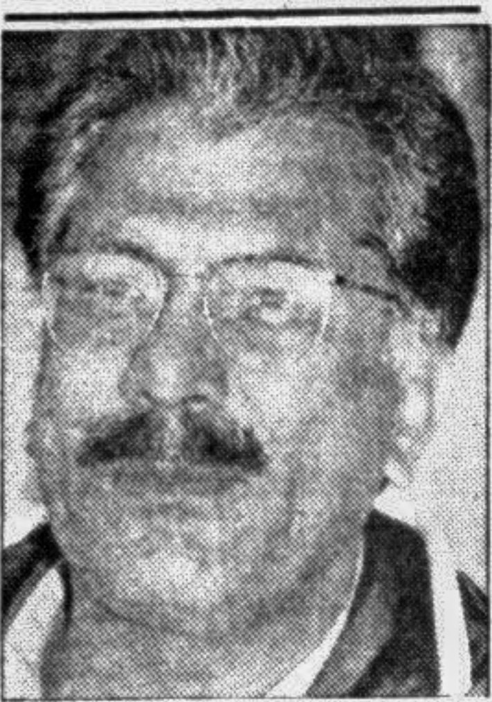
Zaheer Abbas (Former Pakistan star batsman) "Pakistan has another quality pace bowler in the making - Abdul Razzaq. You will hear a lot about him in the future."

✓ Tick the Correct Answers Competition closes 8 pm, May 2, '97