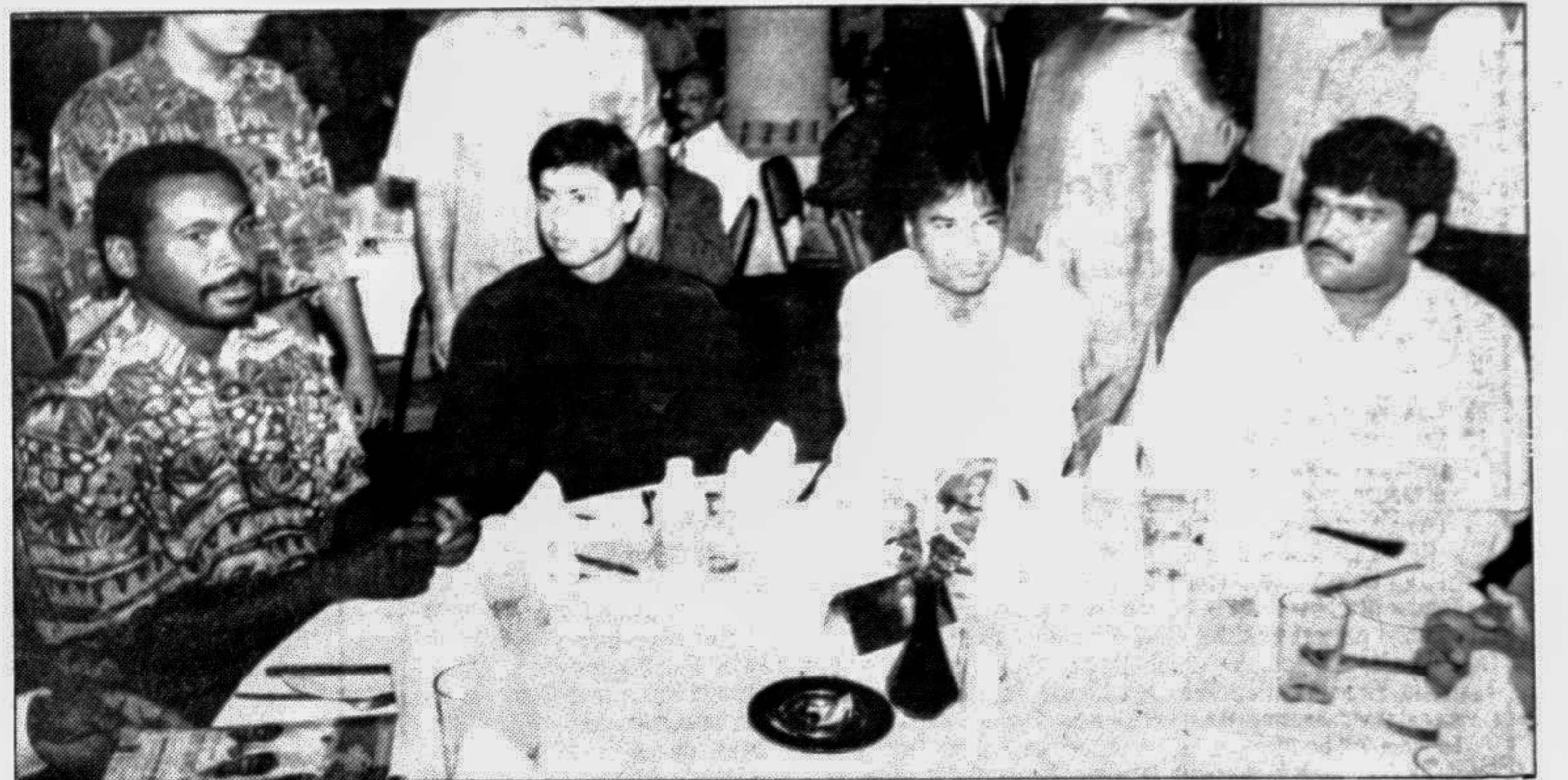
The members of the victorious national cricket team, who are basking in the glorious success of the recently concluded ICC Trophy, seen attending a reception accorded by Mohammedan Sporting Club at a local hotel yesterday.