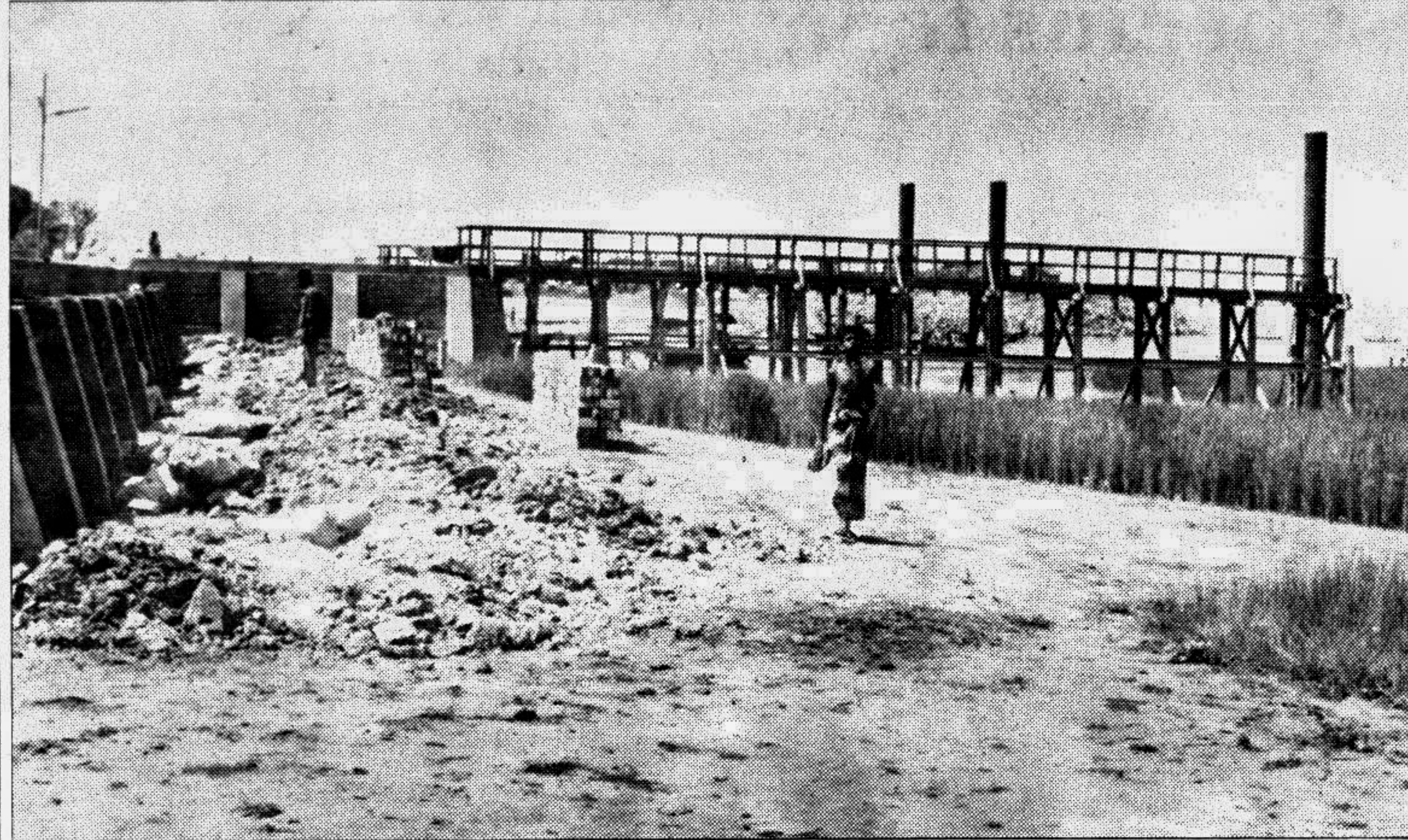
A WASTED PLAN: The Bangladesh Inland Water Transport Authority last year decided to construct an alternative passenger launch terminal at the northern side of the present site of launch terminal in river Dakatia in Chandpur town near the well-known river port of Puranbazar. The decision was taken following continuous erosion of the terminal site which has severely affected docking of all river crafts there. About Taka two crore was sanctioned for the purpose. To everyone's surprise, heavy siltation around the terminal threatened progress of the construction work of the terminal which includes building of thick concrete embankment, partly seen in the picture. Farmers, in the meantime, have taken advantage of cultivating paddy in the highly fertile river bank near the terminal site possibly thinking the place might have been abandoned.

SYLHET, Apr 25: Bangladesh Krishi Bank has taken up a programme here to disburse Tk 69 lakh to aush cultivators, reports UNB. The loan will be disbursed through its 22 branches among the farmers. The bank has already disbursed Tk 75.32 lakh to boro cultivators. About 590 farmers were benefited by it. Besides, the bank has also disbursed Tk 26.10 lakh loan in 11 thanas to 278 farmers for buying cattle for cultivation.