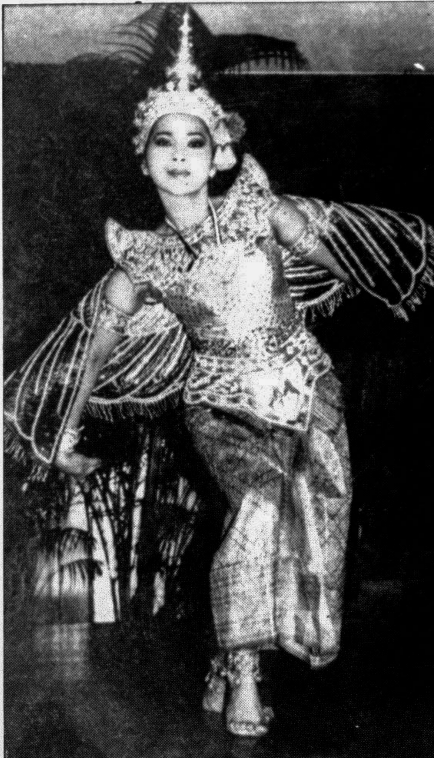
A Thai dancer performing at the inauguration of Thai Trade Fair '97 at Sonargaon Hotel yesterday.

ing is done through feeding the cattle urea and drugs widely available in the markets," he said. He again stressed the need for a regulatory measure on such fattening processes and pointed out that random use of these drugs on cattle could have an adverse effect on public health. At the IPH an official said that its laboratory was not equipped with any device to check the beef or meat. When asked about her opinion on the matter, she said, "we know excessive use of such drugs on animals for meat could be harmful for humans but we do not know up to what extent." Dhaka City Corporation (DCC) which is authorised to certify every cattle on its fitness before slaughter only checks up the overall condition of the cattle. "Do you think we have a lab to test meat?" asked a DCC official.