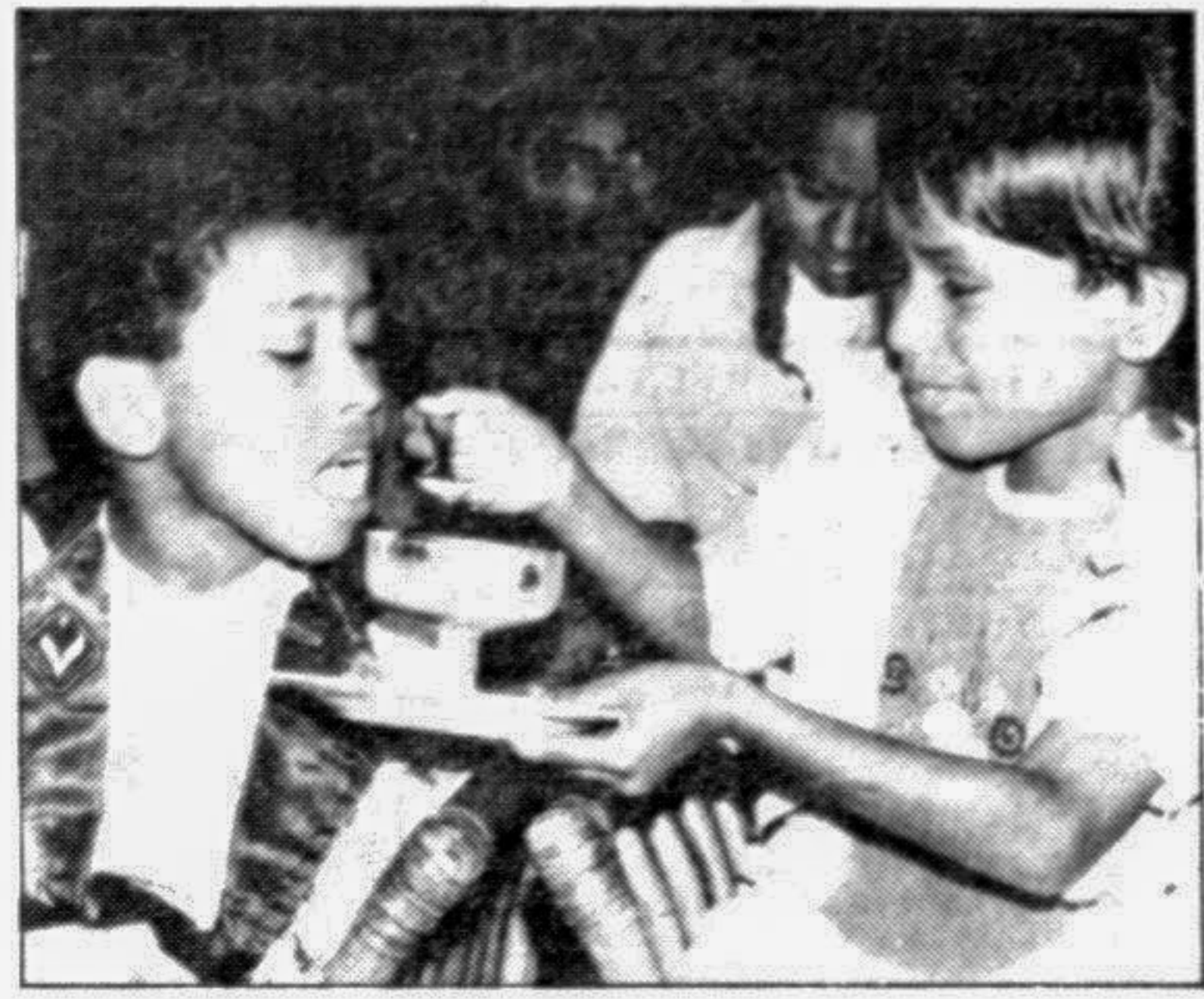
The Pan Pacific Sonargaon Hotel on the occasion of its two-week long Icecream Festival '97 offered icecream to the underprivileged and disabled children and orphans yesterday.

The children, wearing colourful dresses enjoyed the programme at Cafe Bazar of the hotel. Later they went round the hotel.