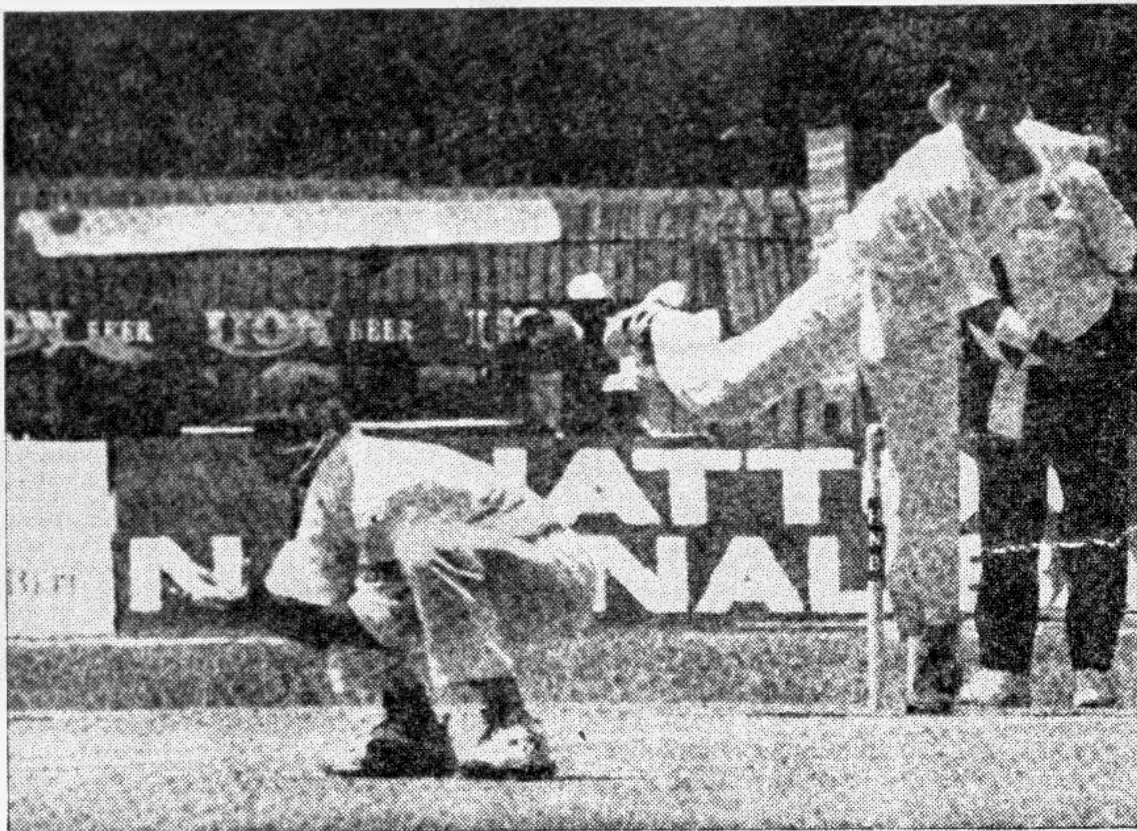
Pakistan off-spinner Saqlain Mushtaq in action during the first Test against Sri Lanka in Colombo yesterday.