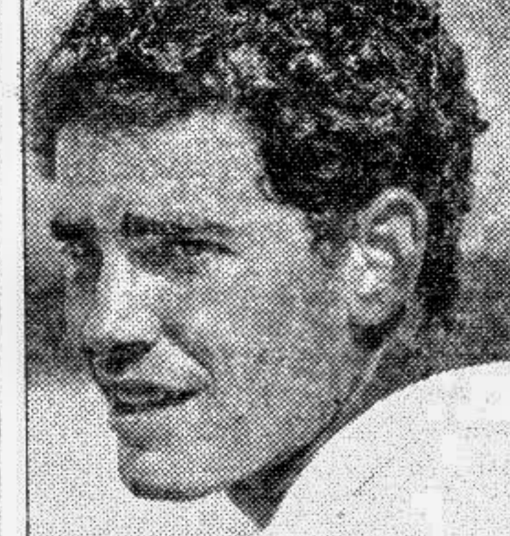
Sampras has been ranked No. 1 at the end of the year for the last four years.

Sampras first went into the No. 1 spot on April 12, 1993 and lost it to Jim Courier, Andre Agassi and Thomas Muster several times but always regained it.