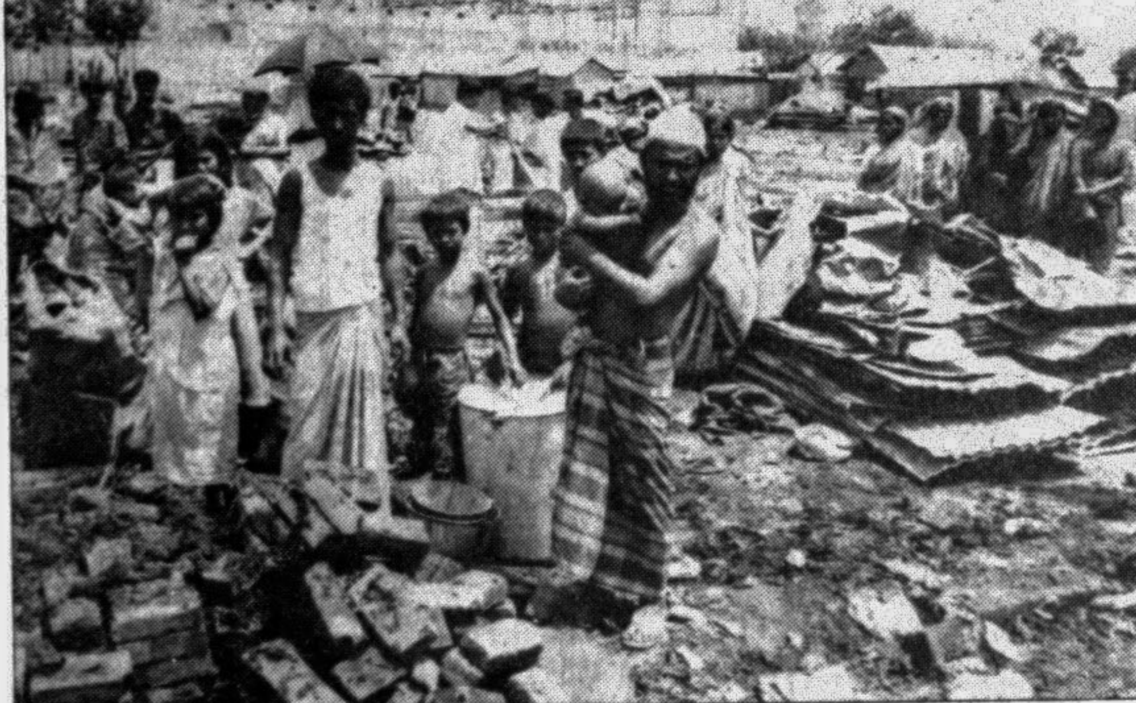
The fire-ravaged Maniknagar slum in the city yesterday.