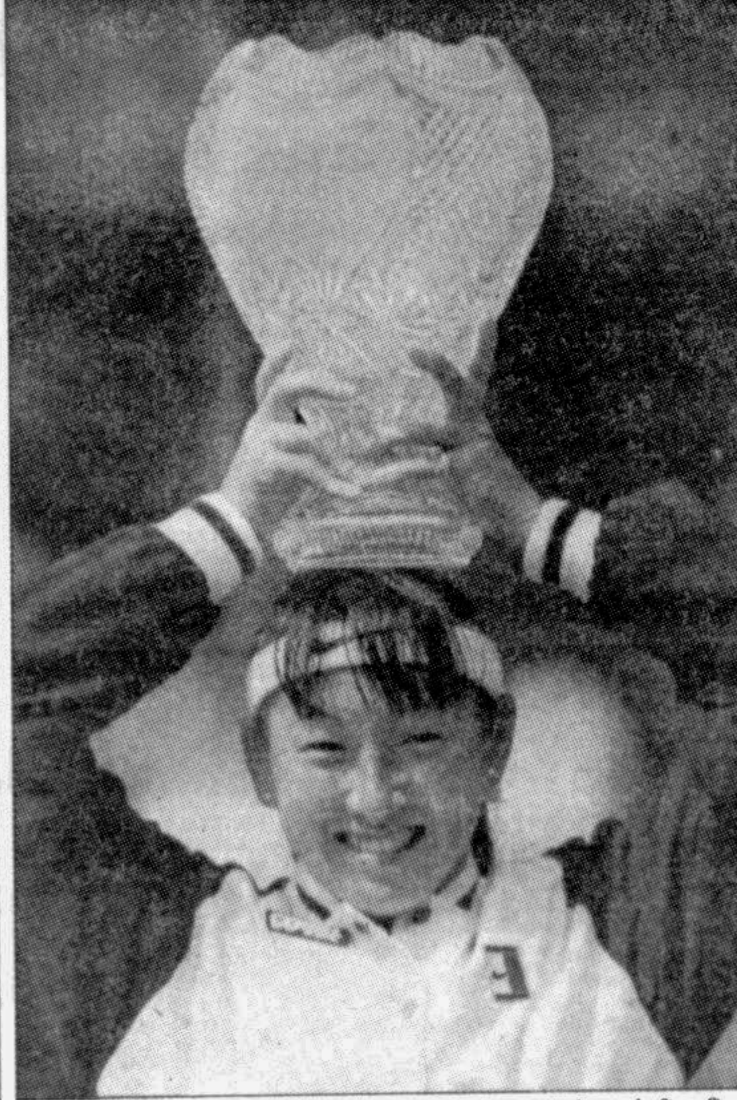
Local player Ai Sugiyama holds the trophy aloft after winning the women's singles title at the Japan Open on Apr 20.