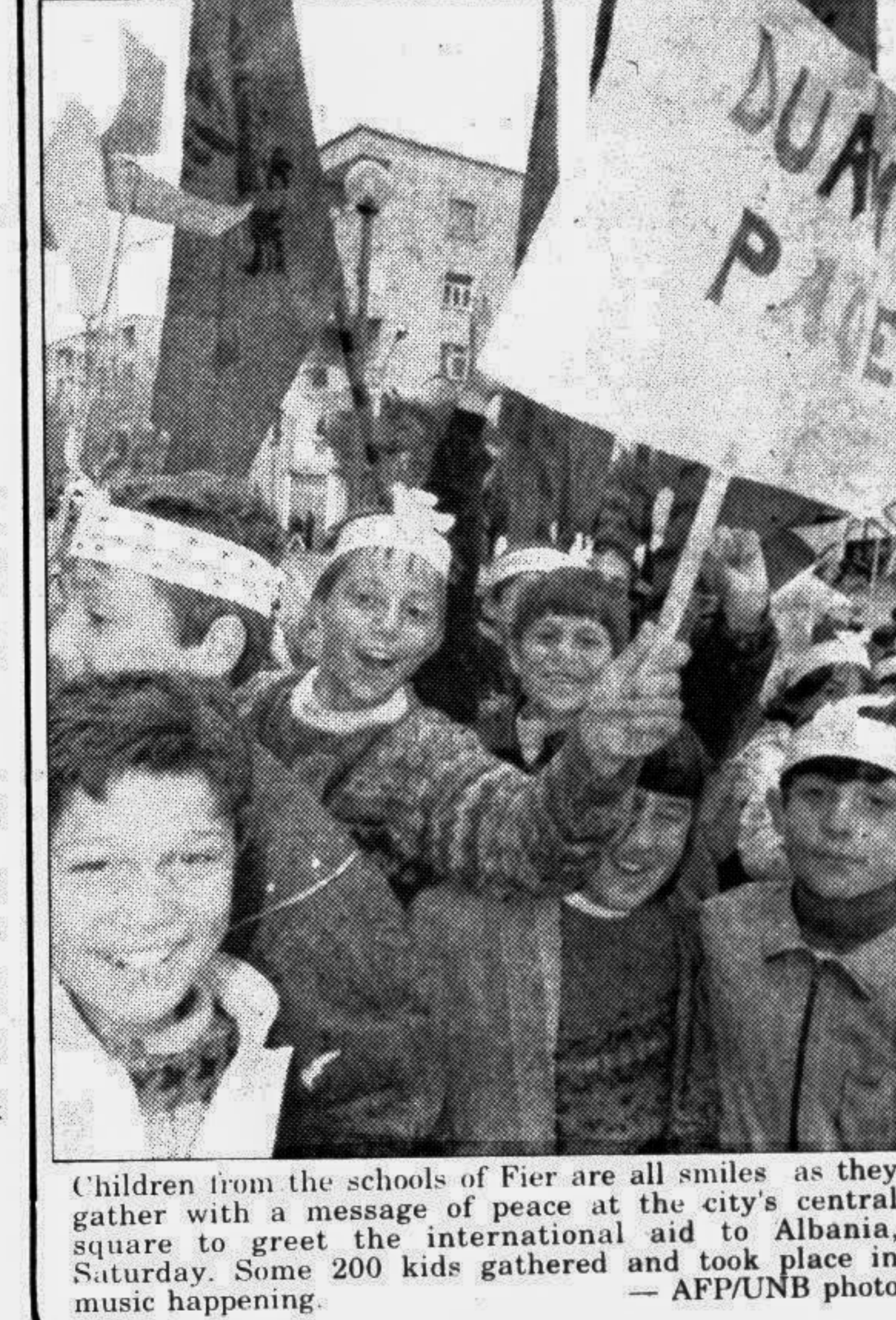
Children from the schools of Fier are all smiles as they gather with a message of peace at the city's central square to greet the international aid to Albania, Saturday. Some 200 kids gathered and took place in music happening.

ANKARA, Apr 20: In a rare public outburst by the military, a senior army official compared the governing Islamic party to Muslim guerrillas in Algeria, reports said Saturday, reports AP.