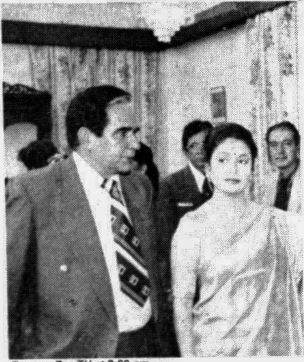
Tara on Zee TV at 2:30 pm

BBC 6:00am BBC World News 6:30 Time Out: Top Gear 7:00 BBC World News in: World Business Report/Asia Today/24 Hours 10:00 BBC World News 10:30 World Focus: Assignment 11:00 BBC Newsdesk 12:00 BBC Newsdesk 12:30 Hard Talk 1:00 BBC World News 1:30 World Focus: Assignment 2:00 BBC World News 2:30 Time Out: Clothes Show 3:00 BBC World News 3:30 Hard Talk 4:00 BBC World News 4:30 Time Out: Top Gear 5:00 BBC Newsdesk 6:00 BBC Newsdesk 6:30 World Focus: Assignment 7:00 BBC World News 7:15 World Business Report 7:30 BBC News Hour Asia & Pacific 8:30 Time Out: Film 9:30 BBC World News 9:30 Hard Talk 10:00 BBC World News 10:30 Time Out: Tomorrow's World 11:00 The