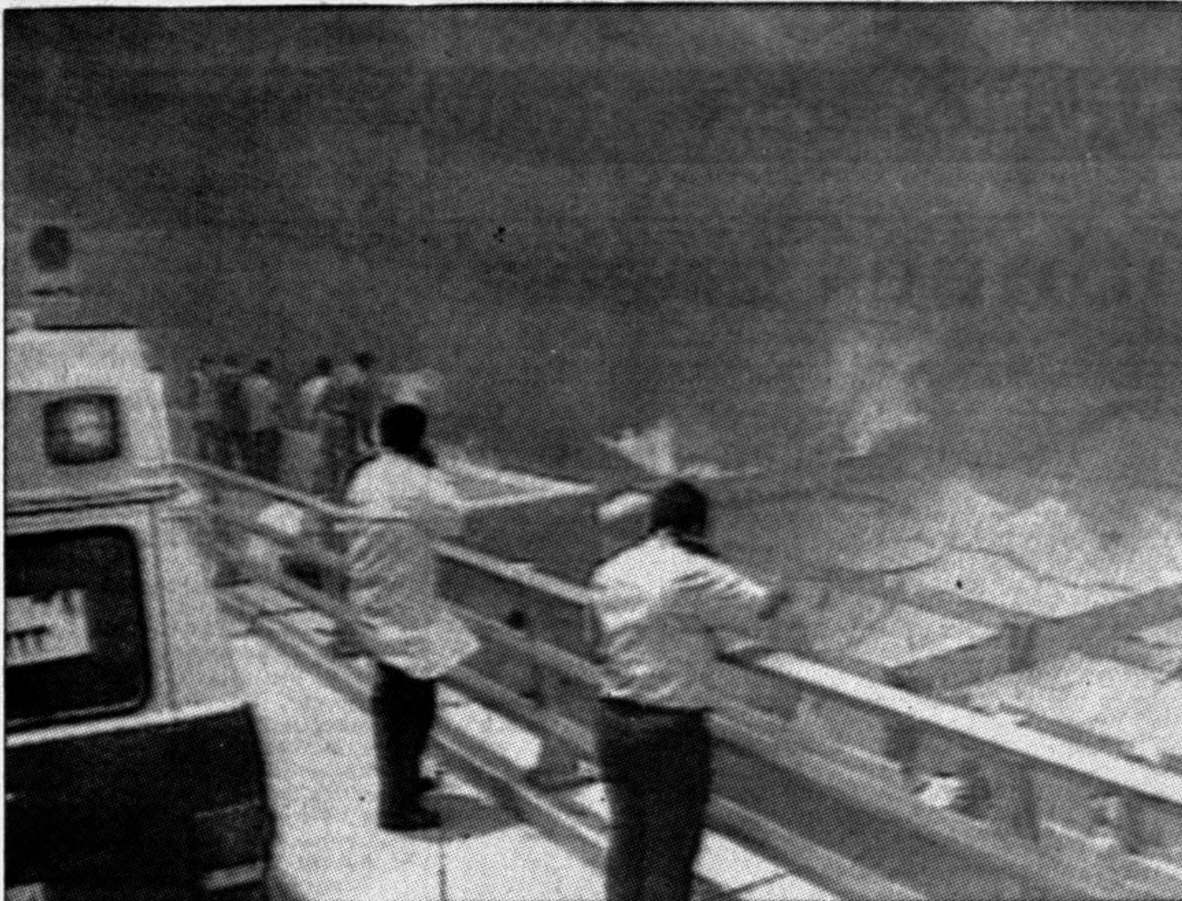
shows rescuers looking at a huge fire that swept through Muslim pilgrims camps near the holy city of Makkah Tuesday...