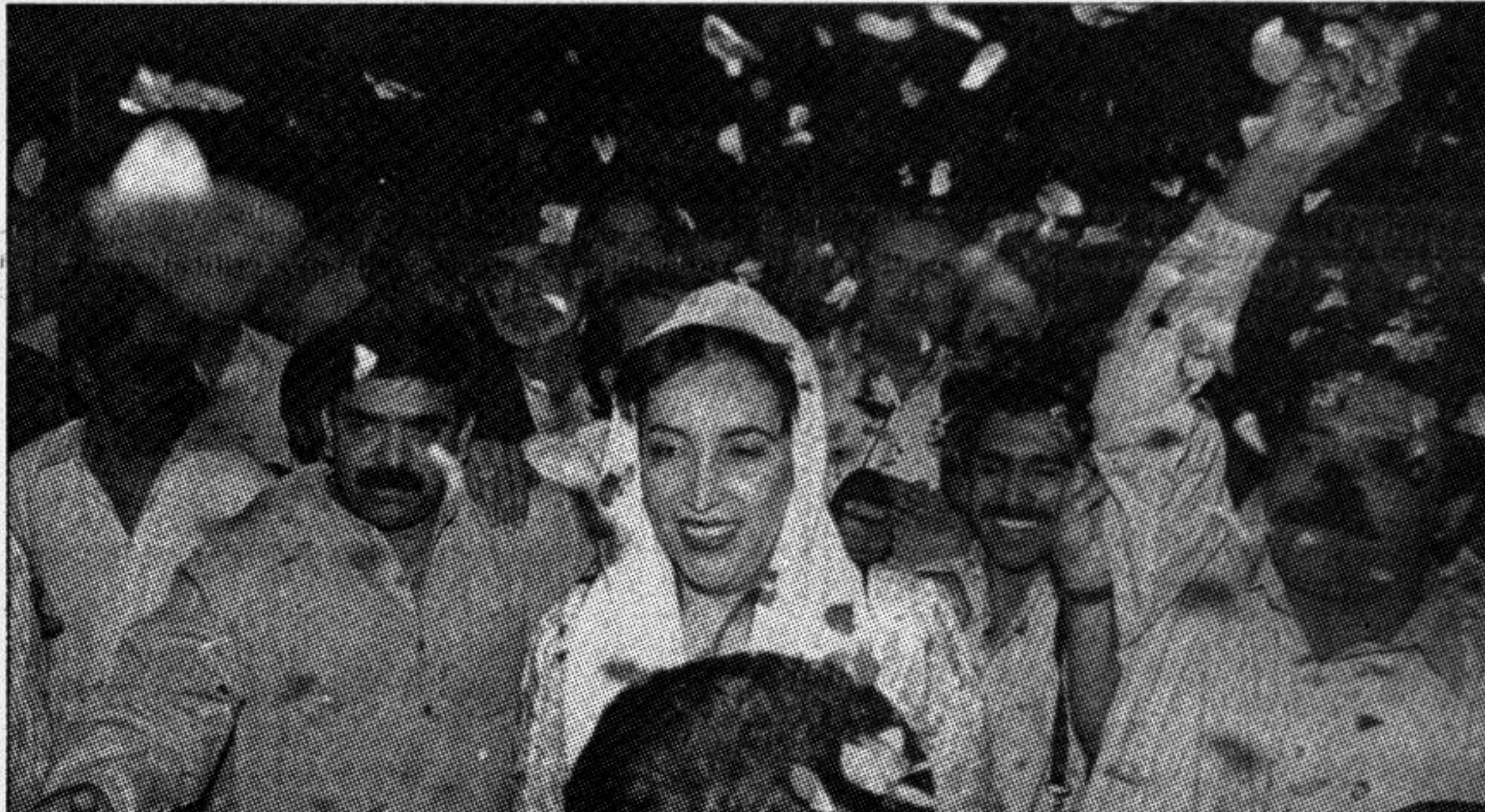
Supporters of former premier of Pakistan Benazir Bhutto (C), shower rose petals, as she returned from London, on Tuesday. Benazir lashed out against the registration of a murder case against her last week...