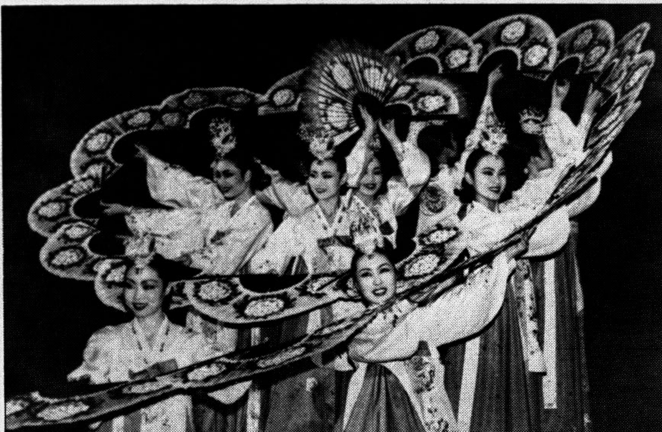
The visiting Korean cultural troupe performing dance in the Shilpakala Academy auditorium yesterday.

He said that if the present trend of population increase is not stopped, the development efforts will bear little effect on the improvement of the socio-economic condition of the people.