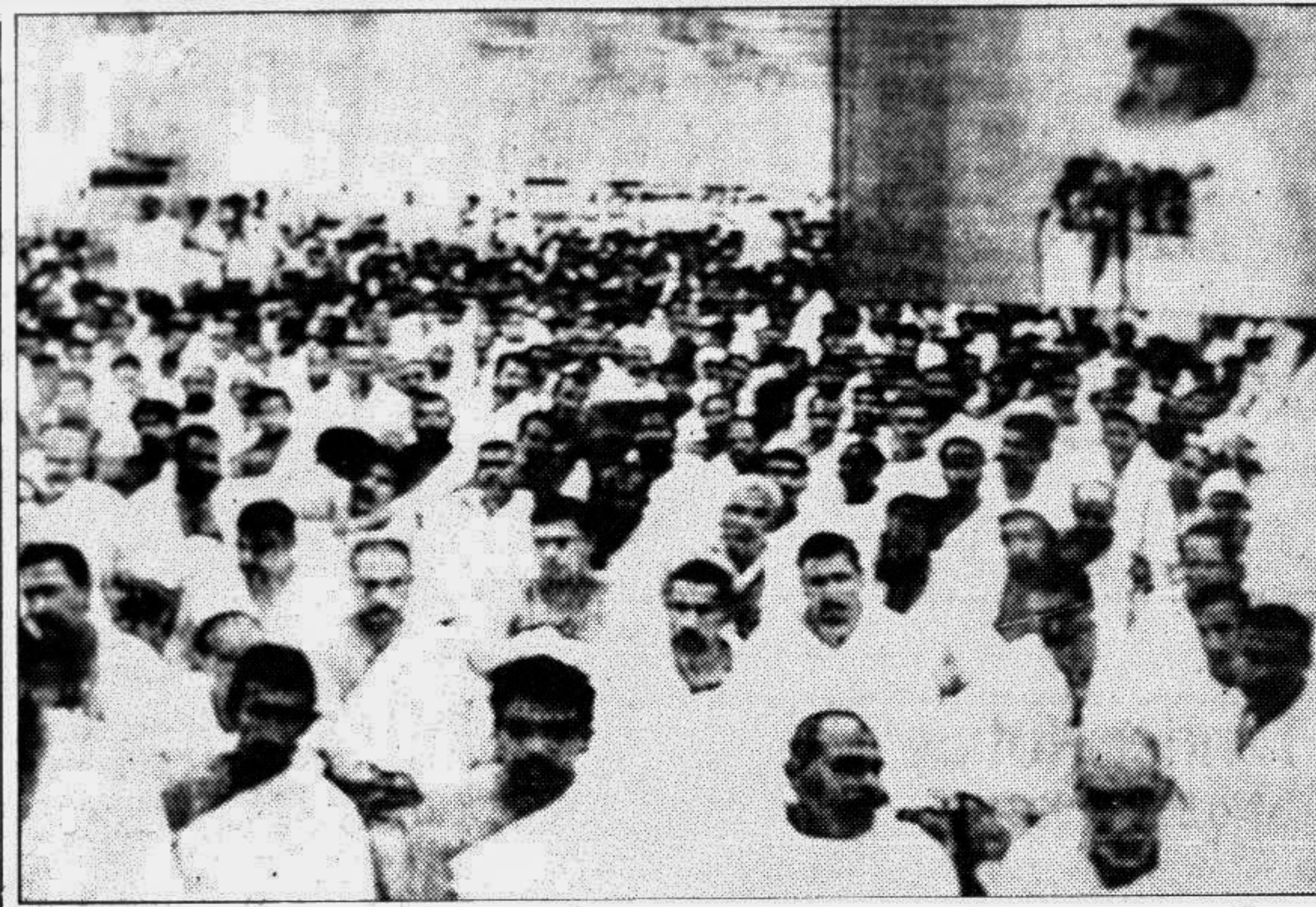
The Holy Hajj was performed yesterday.

The offices of The Daily Star will remain close on April 17, 18 and 19 on the occasion of Eid-ul-Azha. Therefore, there will be no issue of the newspaper on April 18, 19 and 20.