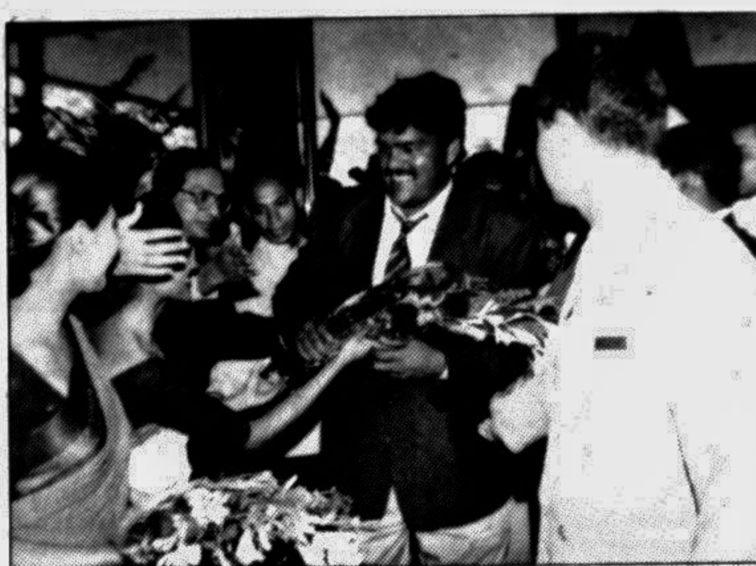
Sonargaon Pan Pacific Hotel accorded a grand reception to the Bangladesh cricket team on Monday. Members of the ICC Trophy-winning team were welcomed with bouquets by hotel officials on arrival.

The Astami Snan took place in 12 ghats on the river including Rajghat, Kalighat, Annapurna and Premtoli at Langabandh under Bandar police station of Narayanganj district. Other programmes of the day included kirtan, basanti puja, mela (fair), devotional songs and feeding of destitutes. The Narayanganj district administration and Hindu Welfare Kalyan Trust provided water, electricity supply, health and sanitation services for the devotees who gathered to take the ritual bath.