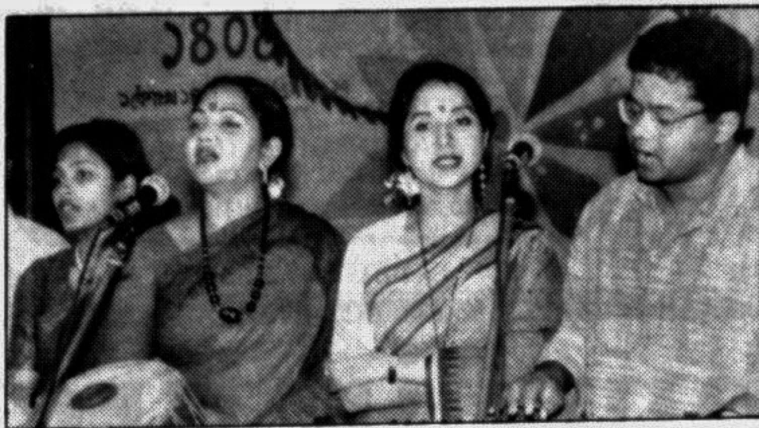
Bangla Academy organised a cultural function in observance of Pahela Baishakh on its premises Monday.