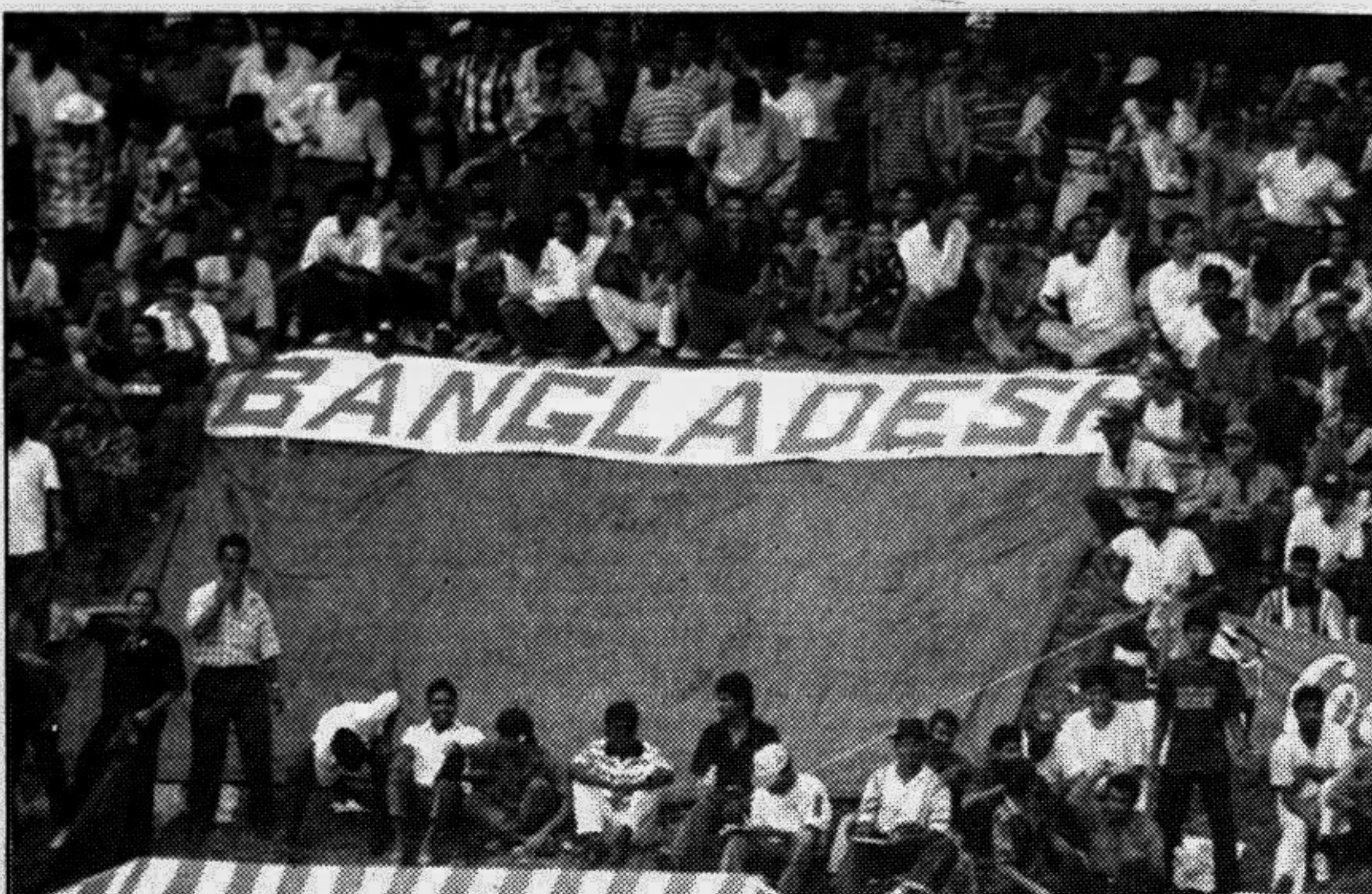
A section of Bangladesh crowd, who gathered at the Kilat Kelab ground in Kuala Lumpur to watch the ICC Trophy final yesterday.