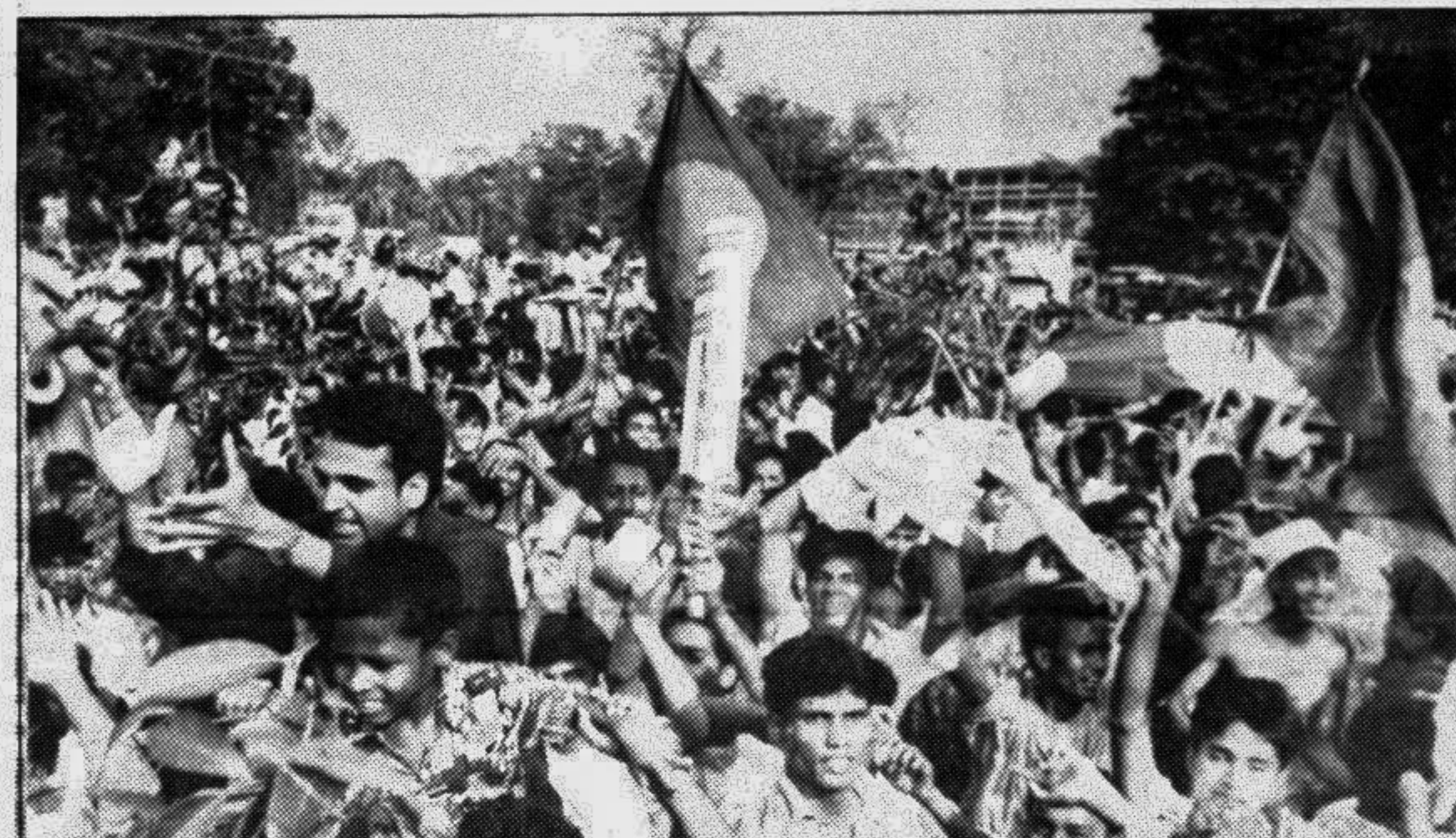
Students of the Dhaka University celebrating Bangladesh's triumph in the sixth ICC Trophy yesterday.

Skipper Akram Khan and middle order Minhajul Abedin followed Aminul having averaged 30.67 and 30.50 respec-