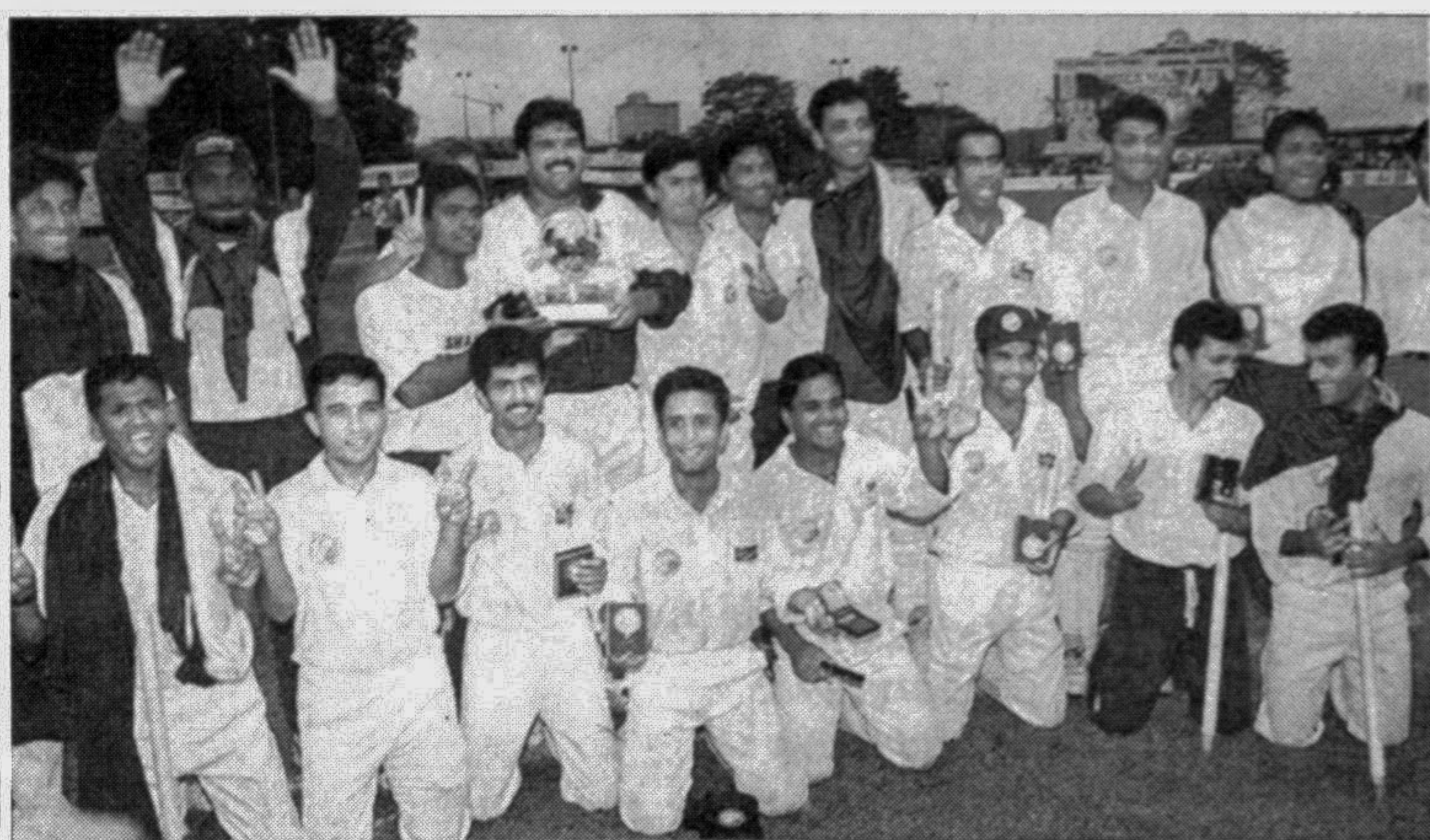
The sixth ICC champions Bangladesh pose with the trophy after pulling off a nail-biting two-wicket win in the final against Kenya in Kuala Lumpur yesterday.