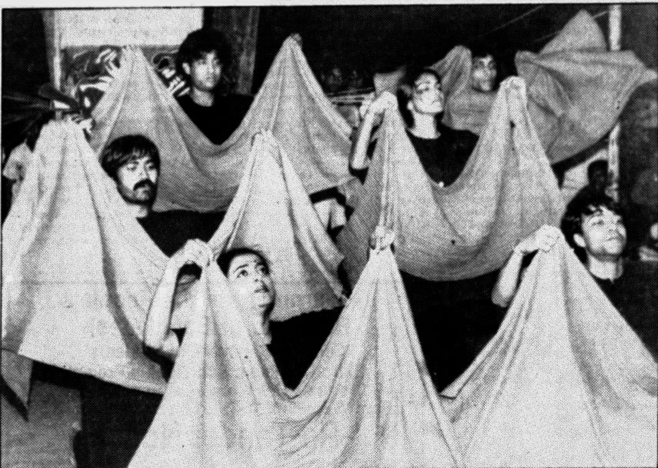
Sequence of the drama 'Haye Bangla, Haye Behula' staged at the Public Library in the city yesterday on the concluding day of the Bengali Cultural Festival 1403.

For more information call-Dhaka: 9565114, 607657, 887771, Chittagong: (031) 712127, Khulna: (041) 725008, N. Ganj: (671) 74336