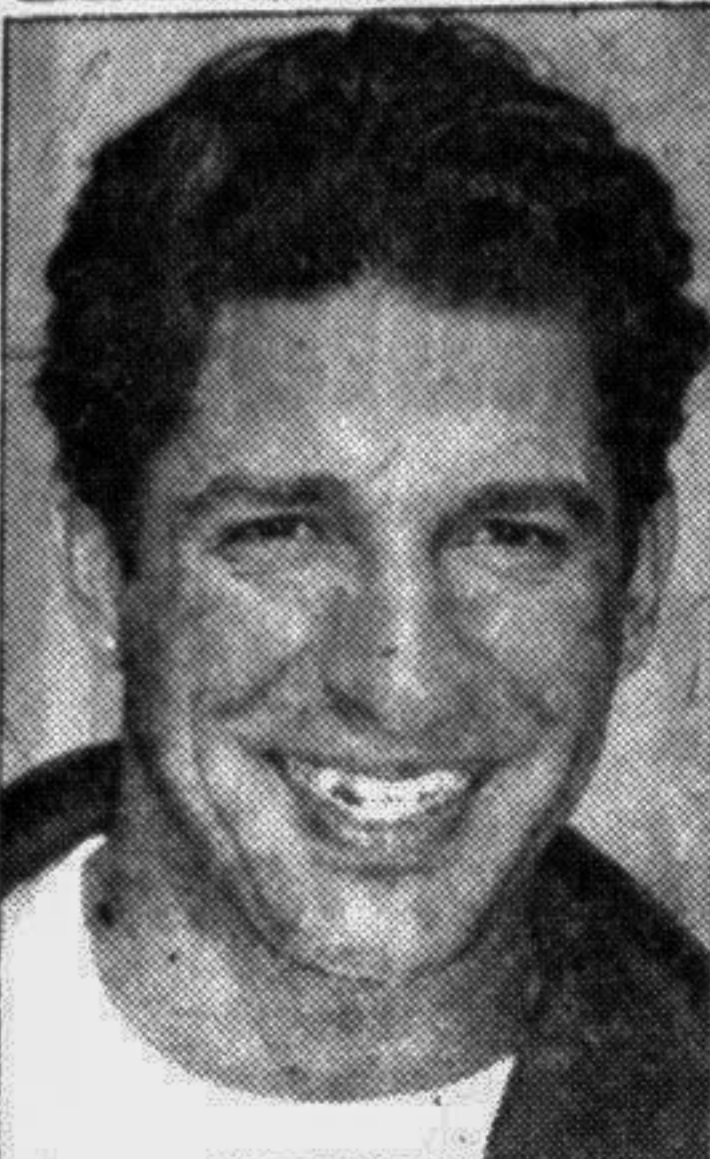
Wasim Akram (Pakistan cricket captain) Aravinda is in a class of his own. He is capable of anything, with the bat, ball or in the field. There are few better match-winners than him.

WIN TK, 2000/- PRIZE BOND EVERY FORTNIGHT