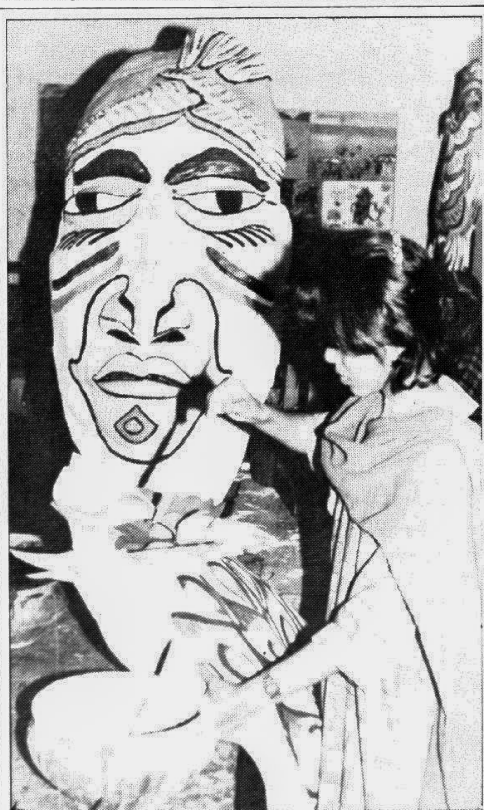
Students of the Fine Arts Institute, Dhaka University taking preparations for a rally on Pahela Baishak.

Trees will be a precious asset for you when you live in the Coastal areas. When well-grown trees will protect you and your home from storms and tidal surges. When pruned wisely they will give you fuel. When you choose the right species, they give you fodder for your livestock. Some trees like guava, mango and jack will give you fruit as well. You can now well understand ... trees can give you more. Plant trees by roadsides, embankment slopes and around your homestead in a planned way. Help trees to grow. You will be immensely benefited in the long run. For further information contact your local forest official today. "Plant Trees Along the Coast." DFF-8699-9/4 Coastal Greenbelt Project G-1025 Banabhaban, Mohakhali, Dhaka.