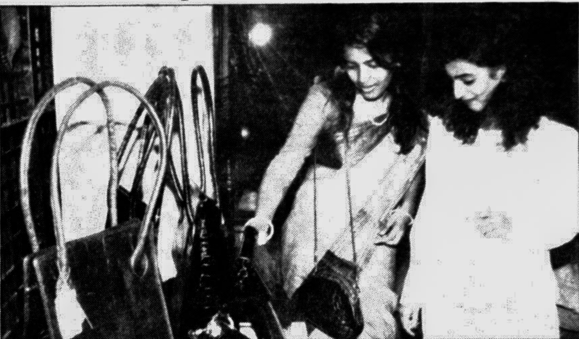
The SAARC Women's Association held a charity handicraft and food bazar at the premises of the Embassy of Nepal yesterday.

Biddyt/Jana-1103(4)/96-97 DFP-6598-20/3 G-994