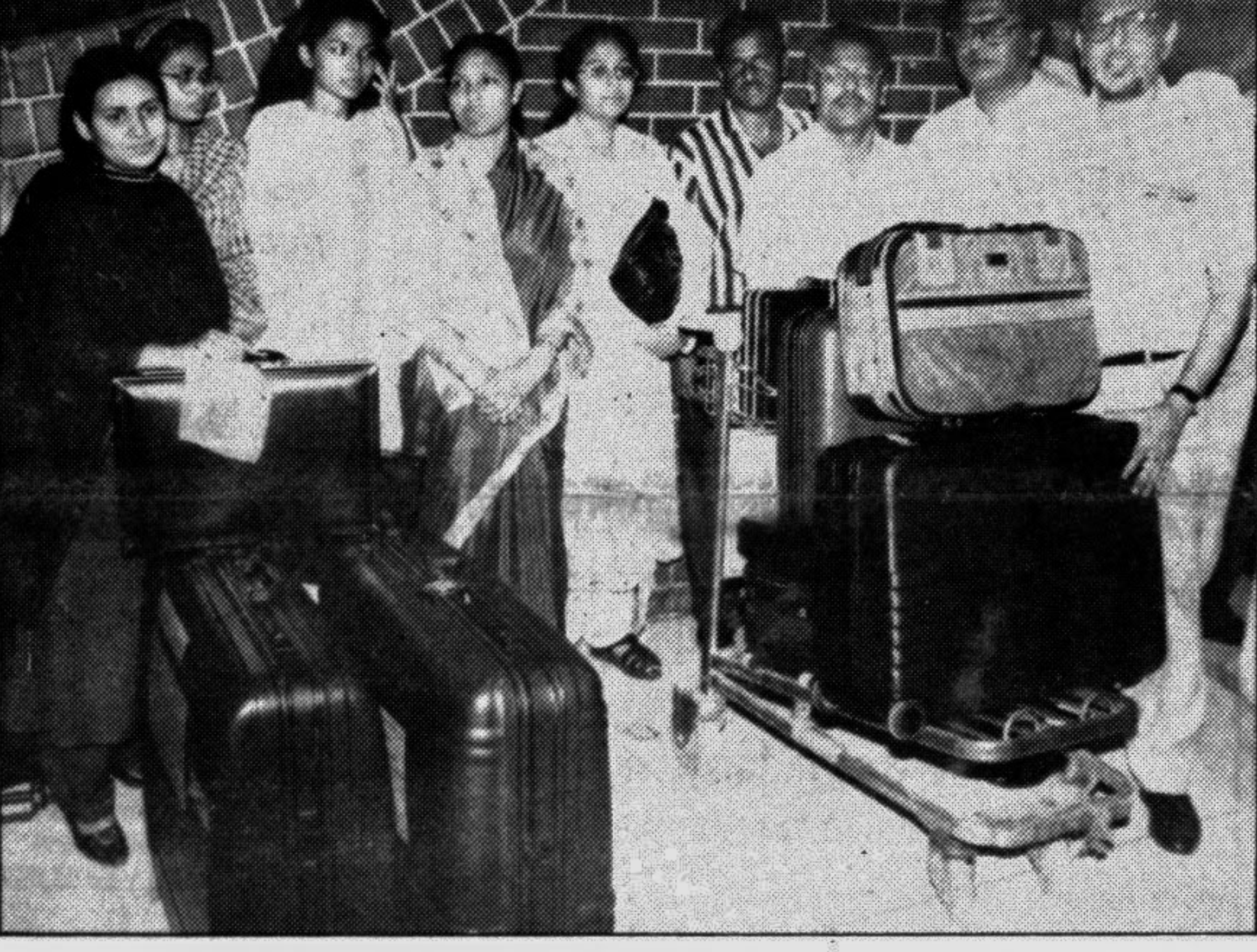
Some of the stranded passengers at the Zia International Airport yesterday.