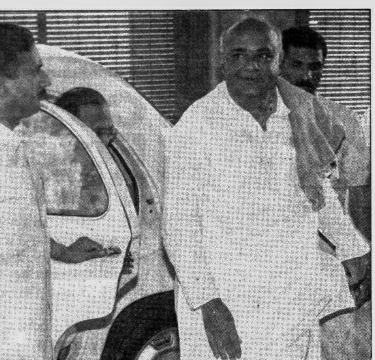
HD Deve Gowda arrives at parliament in New Delhi yesterday prior to the vote of confidence.

NEW DELHI, Apr 11: Prime Minister HD Deve Gowda's 10-month-old government lost a confidence vote in parliament today, requiring its resignation, reports AP. Gowda challenged his opponents to face him in new general elections. The vote was 292-158 with 8 abstentions, the speaker of the house, PA Sangma, announced after an electronic vote. He said