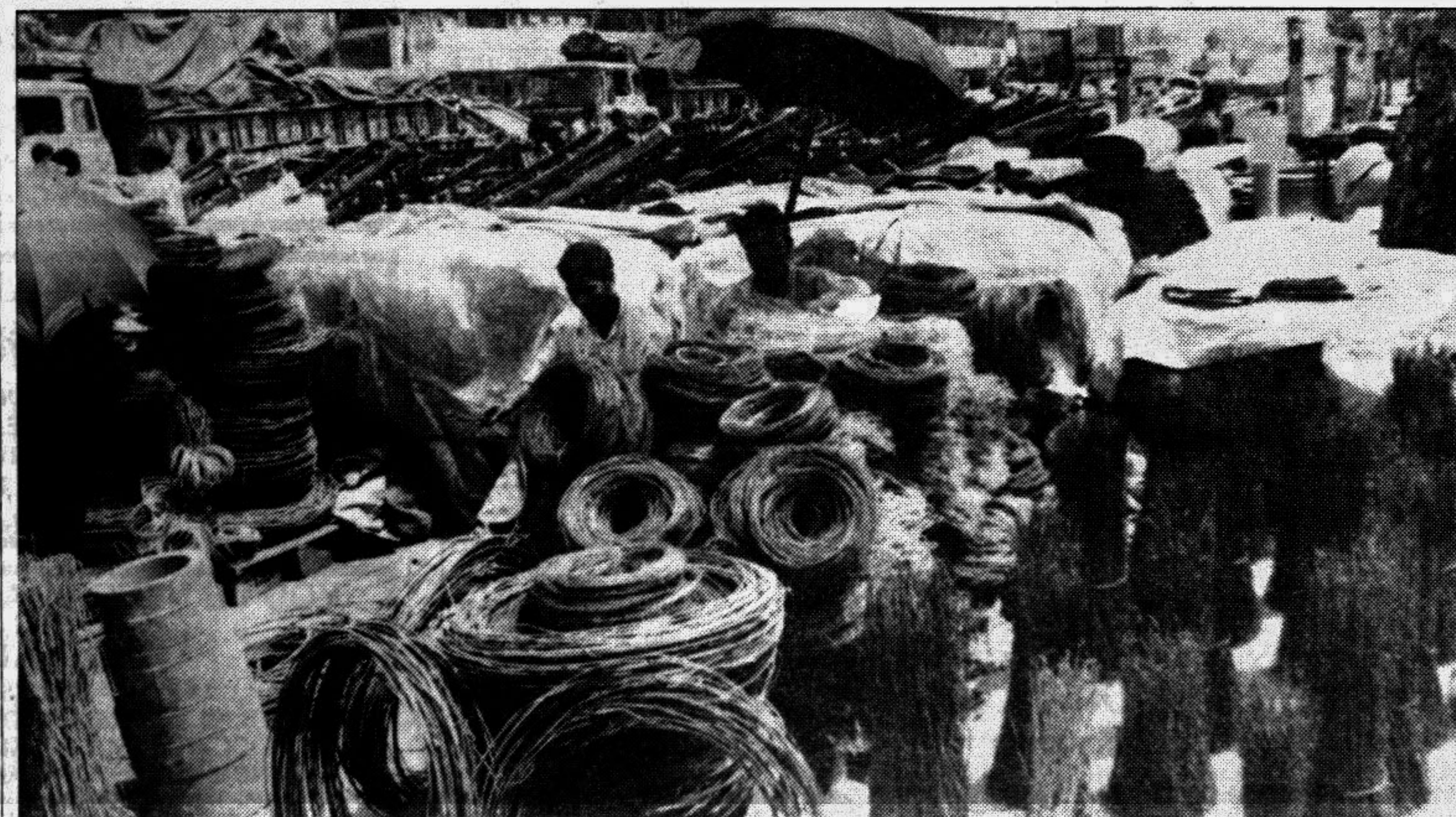
The pavement, alongwith part of the road, in front of the Nayabazar Yousuf Market in the city has long been occupied by vendors.