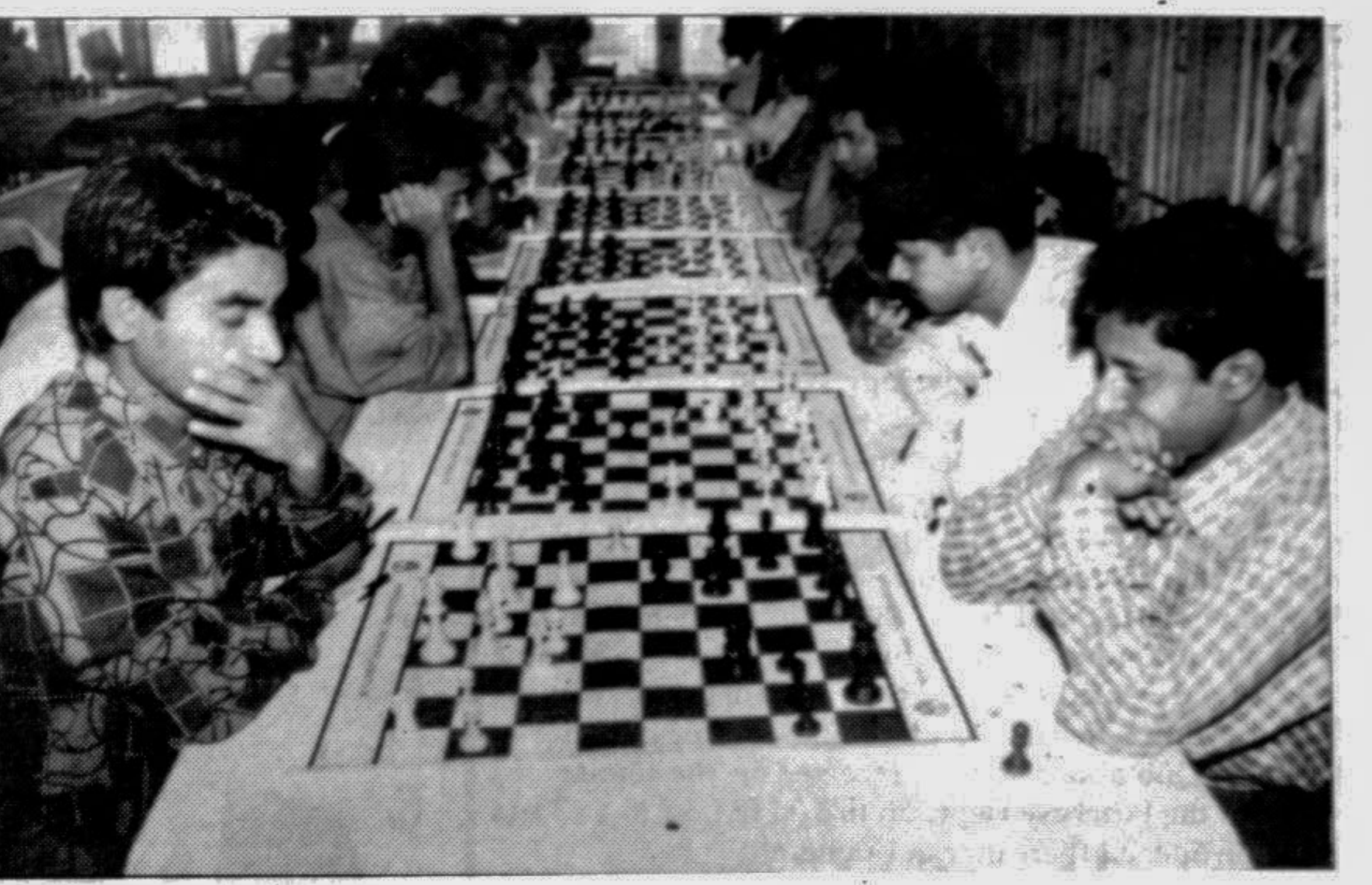
Scene from the 23rd national chess qualifiers at the NSC yesterday.

Meanwhile, the remaining boys' division matches of the 8th Bata Schools handball championship resumed at the court next to Dhaka Stadium.