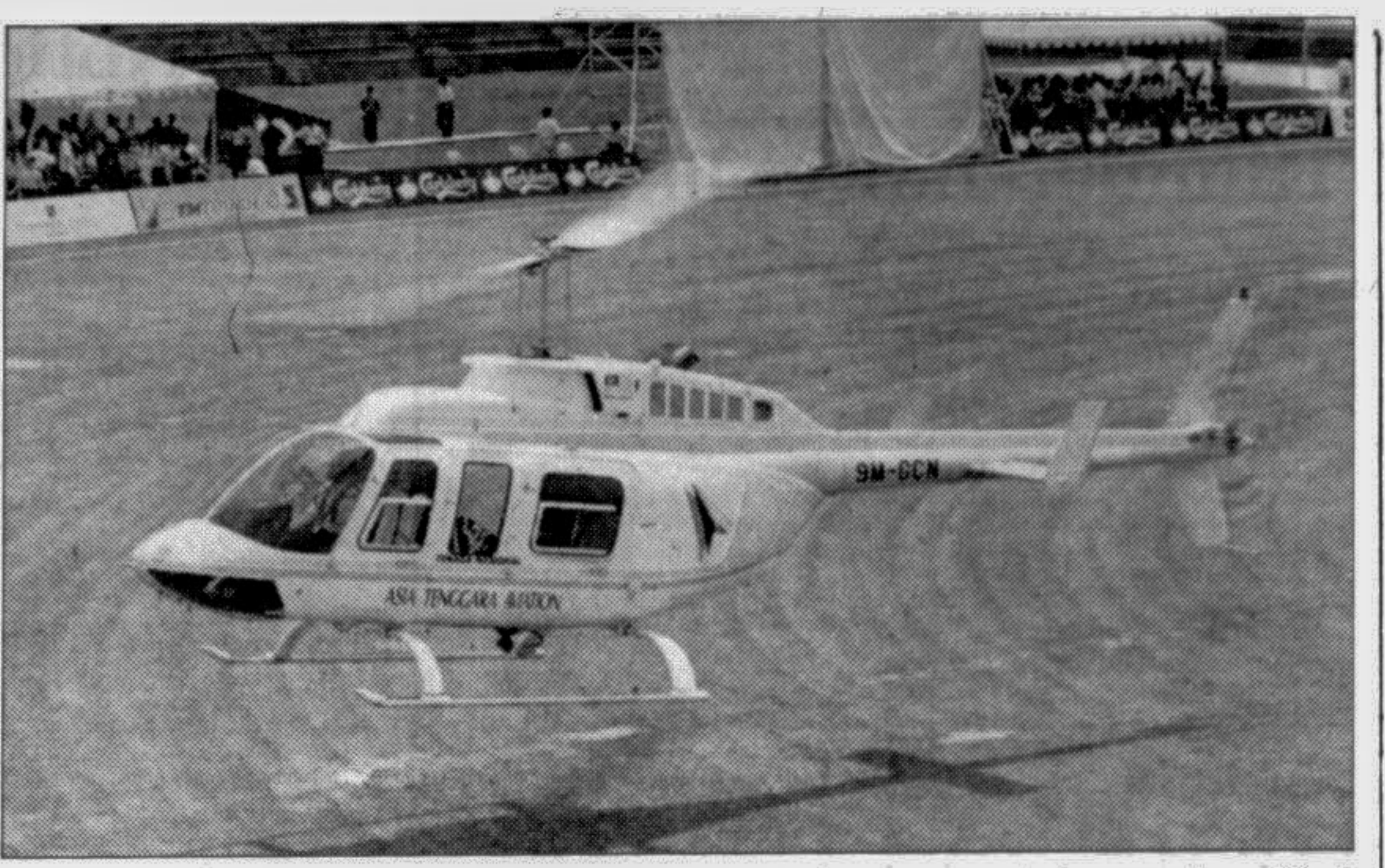
A chopper being used to dry the soggy outfield before the start of the second semifinal yesterday, which was delayed by five hours due to overnight shower.