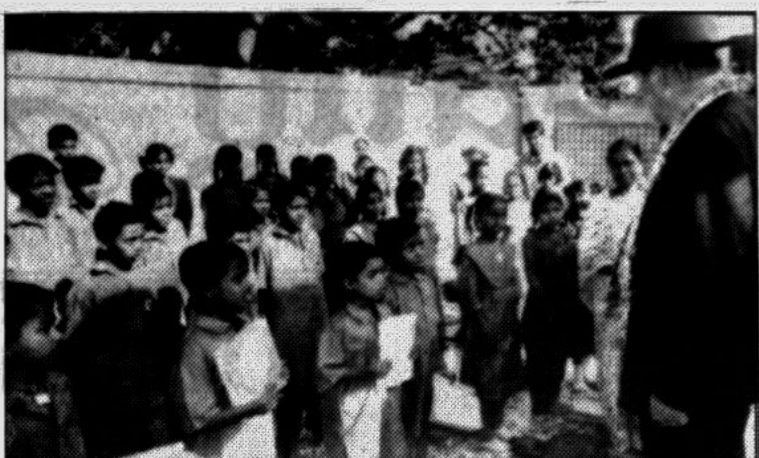
Deputy Prime Minister of Australia, Tim Fischer (R), talking with students of Surovi School during his visit yesterday.