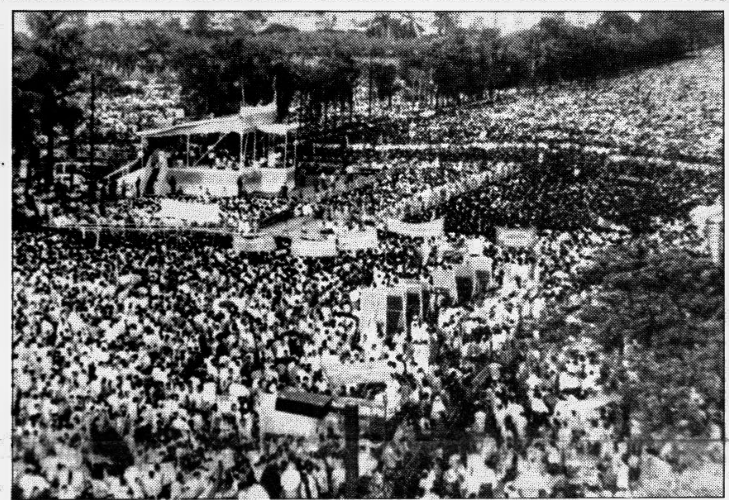
A partial view of the Awami League public meeting at the Manik Mia Avenue in the city yesterday.

The Prime Minister claimed that her government inherited See Page 12 Col 7