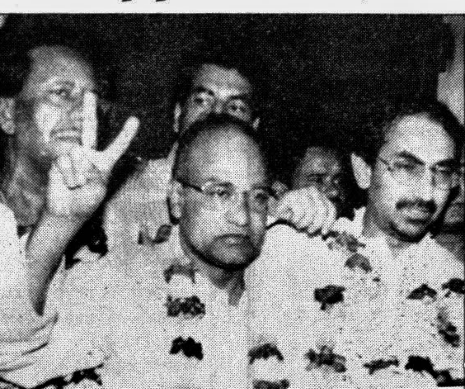
BNP leaders (From R-L) Mirza Abbas, MP, Mosharraf Hossain MP, and Abdul Mannan MP after their release from the Dhaka Central Jail yesterday.