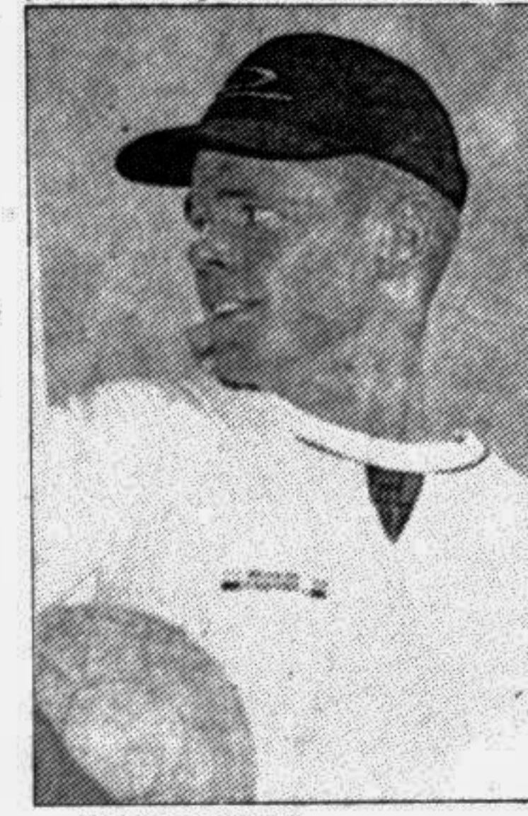
S POLLOCK ... m-o-m

runs. Warne first removed Cullinan and Bacher. Jonny Rhodes was forced for one by a Jason Gillespie inswinger and Jacques Kallis was run out for one by Steve Waugh. Captain Hansie Cronje (28) and Derek Crookes (17) regrouped with a sixth-wicket partnership of 36 but South