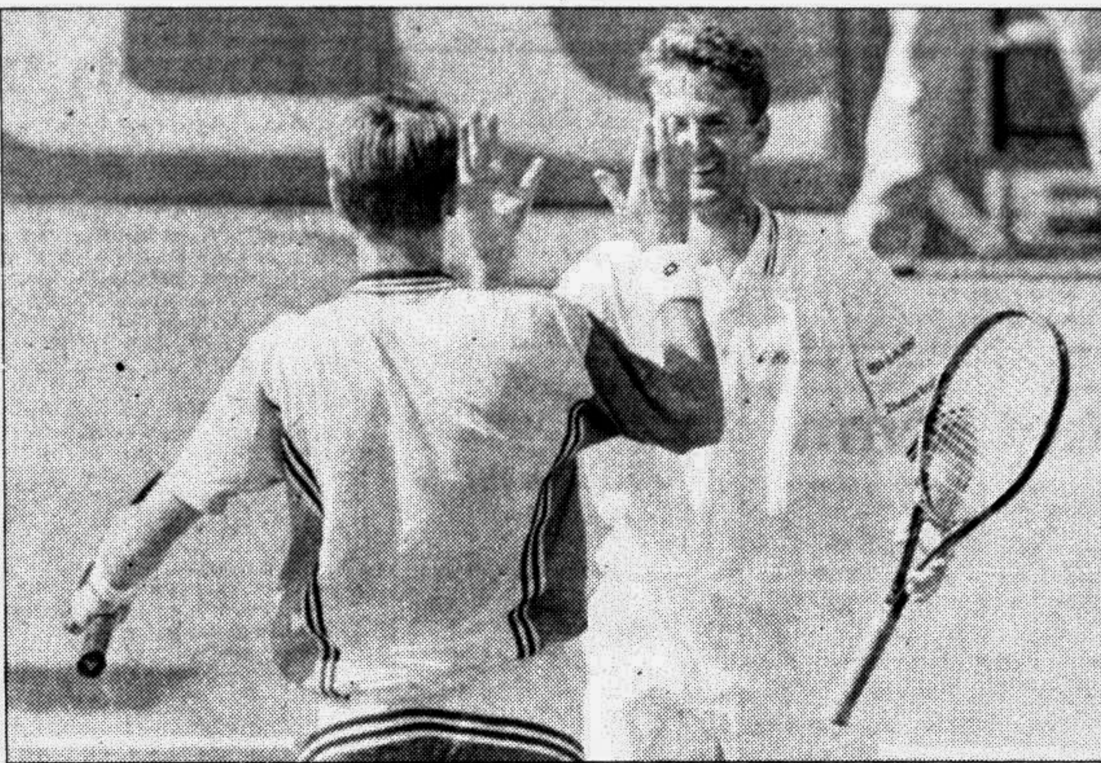
Paul Haarhuis (L) and Jacco Eltingh from the Netherlands celebrate victory against the United States after their Davis Cup doubles match in Newport Beach, CA on April 5.