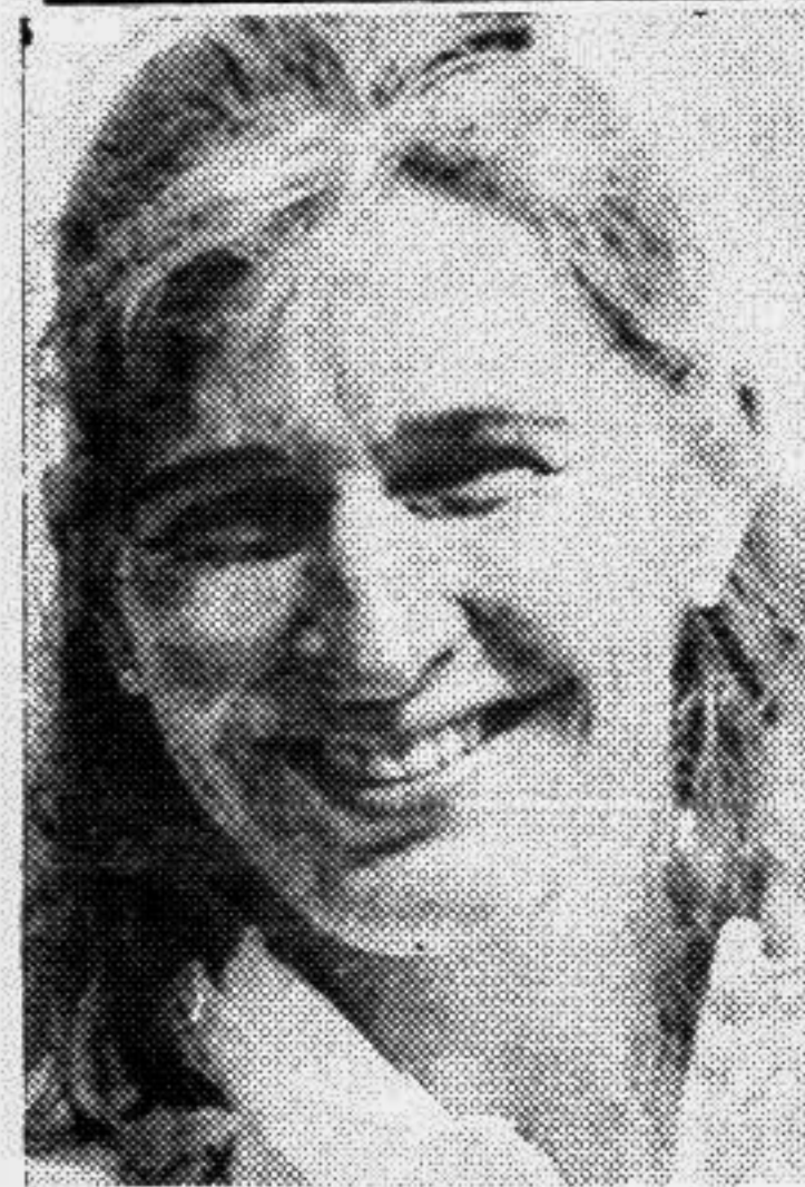
Steffi Graf (German tennis star) To get voted by the fans as the most exciting player is a little more important than player of the year.