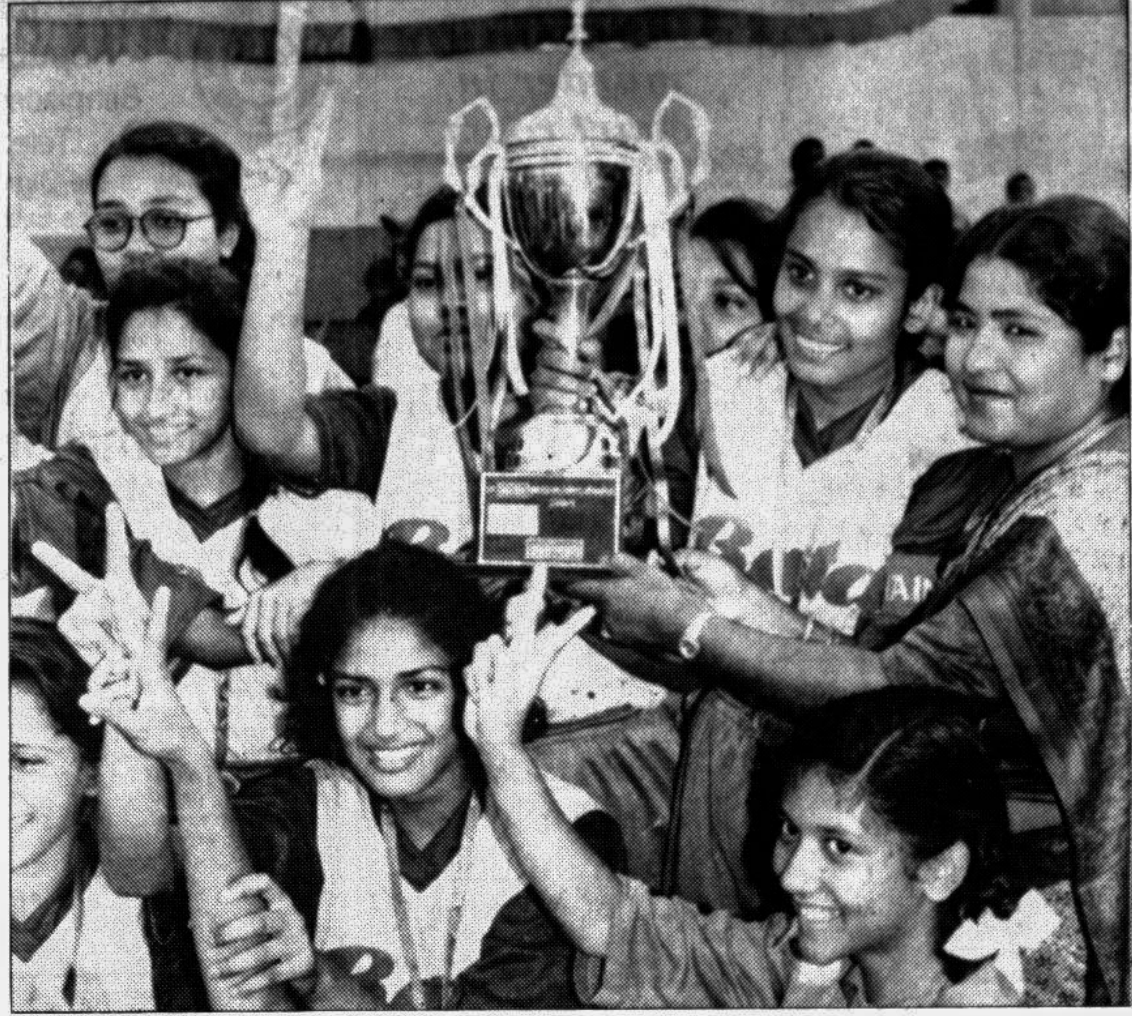
The players of Viquarunnissa Noon team with the 8th schools handball championship trophy at the Dhanmondi Women's sports Complex yesterday.