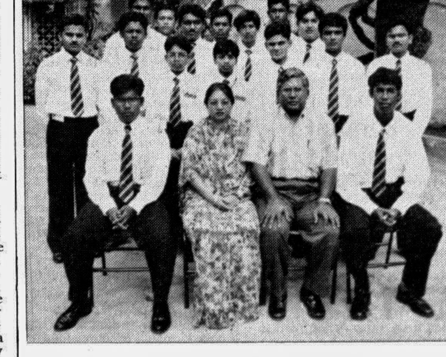
The cricket team of Loreto School, which left the capital on April 5, to feature in a few exhibition matches against different schools of Calcutta.