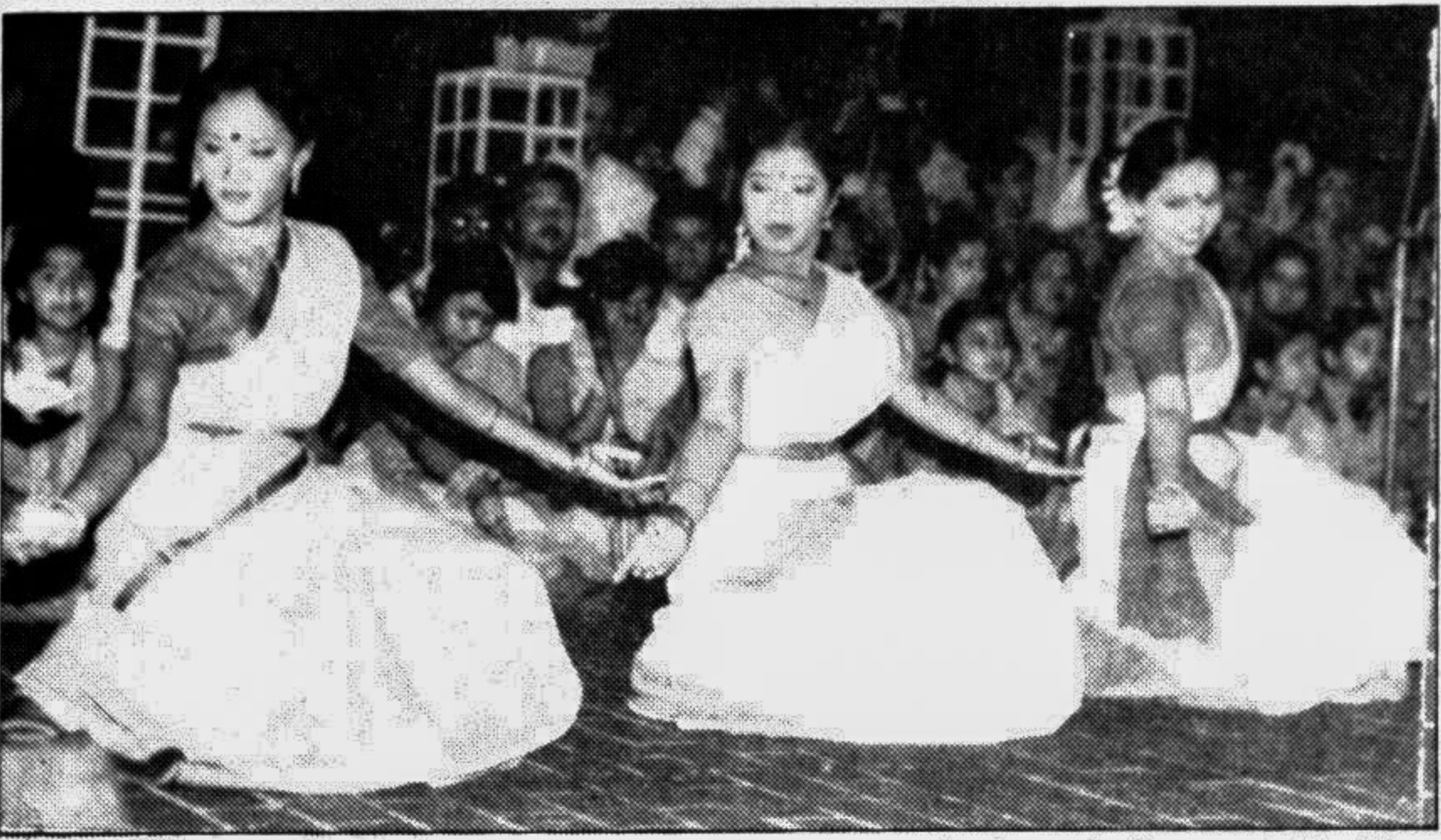
Artistes of 'Surer Dhara' presenting a dance drama by Rabindranath Tagore at the Fine Arts Institute of Dhaka University yesterday.