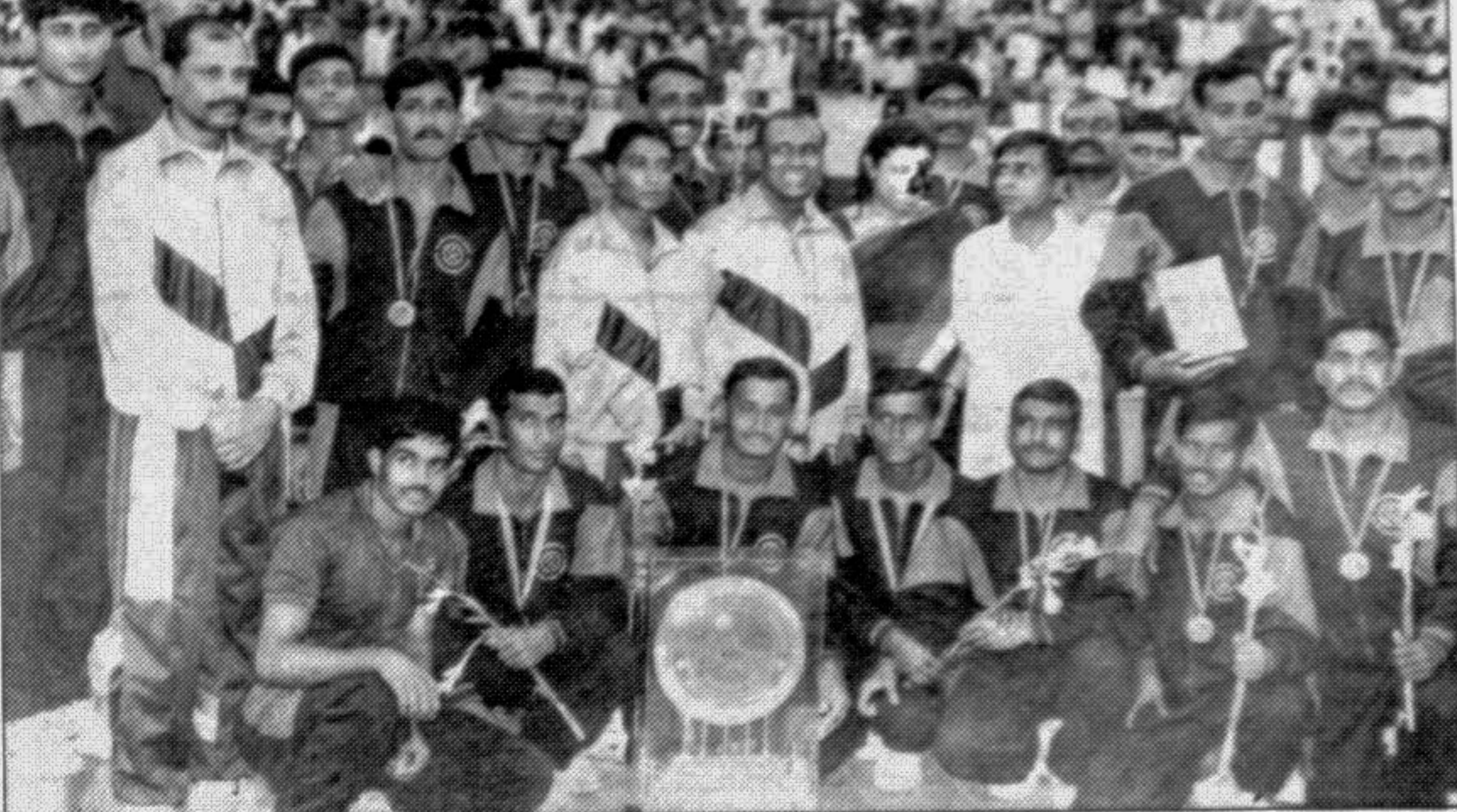
Bangladesh Army, winners of the Beximco Independence Day international water polo tournament, pose with the trophy after defeating Calcutta University Institute in the final at the National Swimming Complex yesterday.