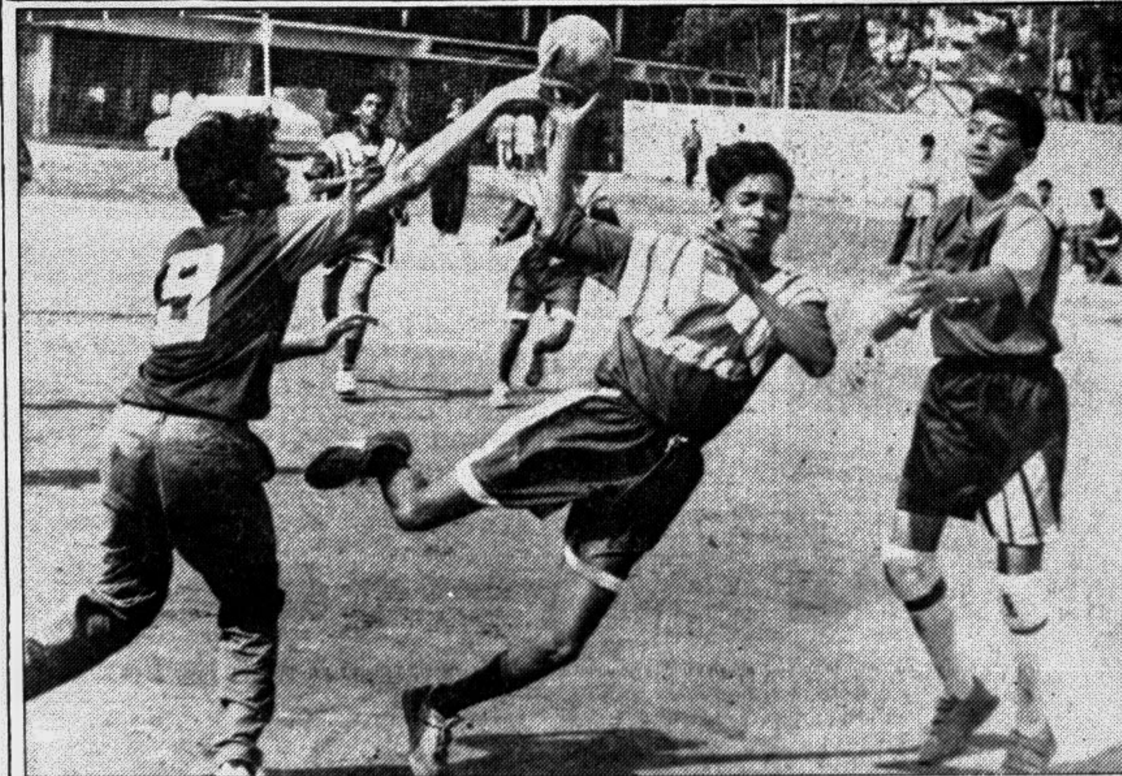
Action from yesterday's 8th Bata schools handball tournament clash between Kamalapur Railway High School and Cosmic International School at the handball court of Dhaka Stadium.