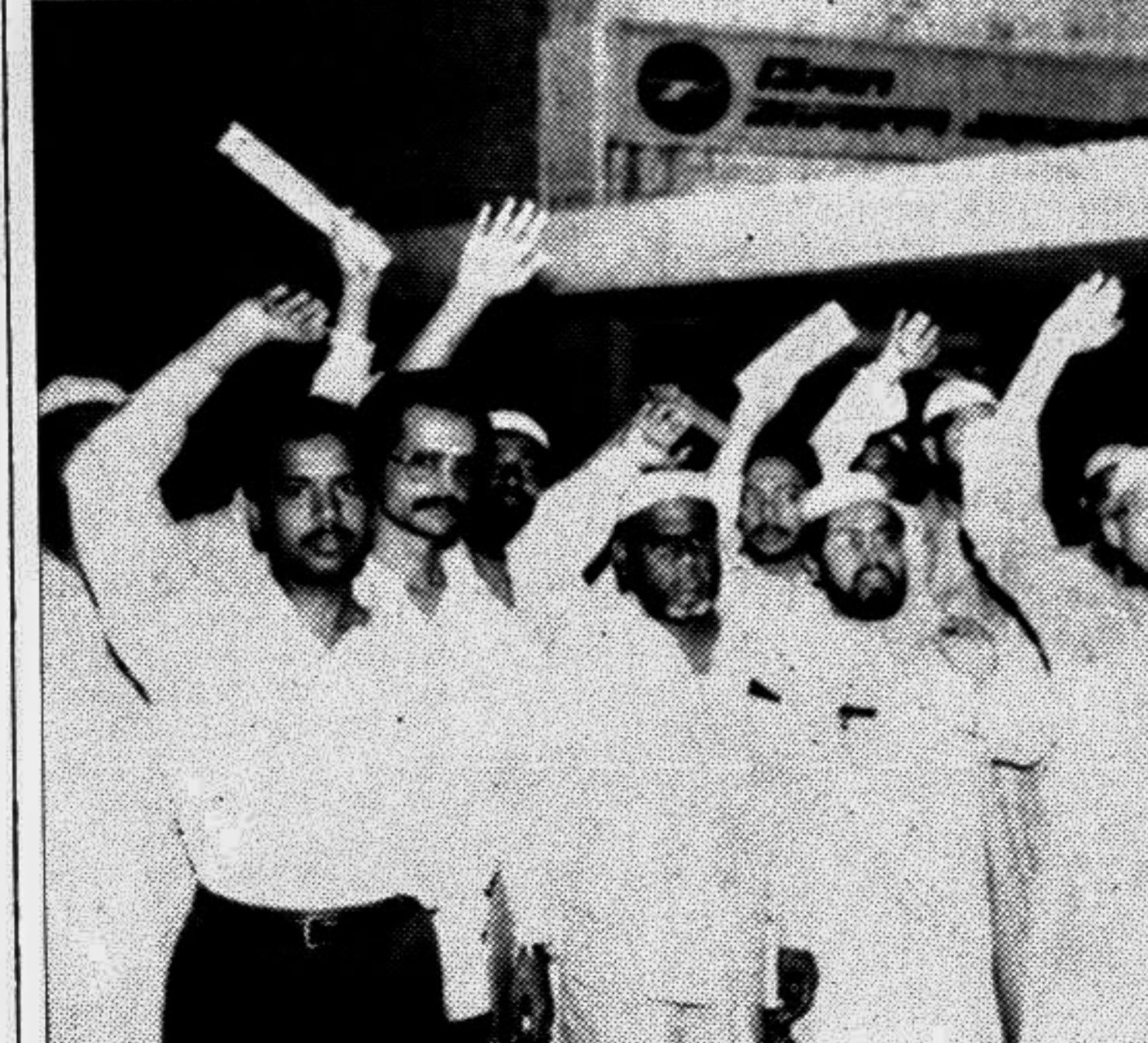
Intending Hajj pilgrims vent their anger demonstrating in front of Bangladesh Biman office after failing to get their flights confirmed. Some 2800 non-ballotees wishing to perform hajj, who obtained visa and bought tickets, are waiting for their flights, which the national airline is yet to organise.

'You are not alone, we are with you,' she told the pavement vendors and called upon all to rally round the banner of BNP to free the country from the 'clutches of conspirators.'