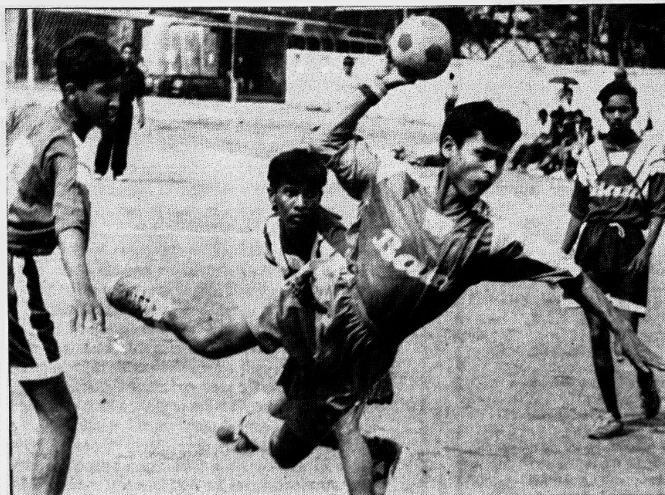
Action from yesterday's 8th Bata schools handball tournament engagement between Shaheed Nabi High School and Kamalapur High School at the court. Shaheed Nabi won the match 32-6.