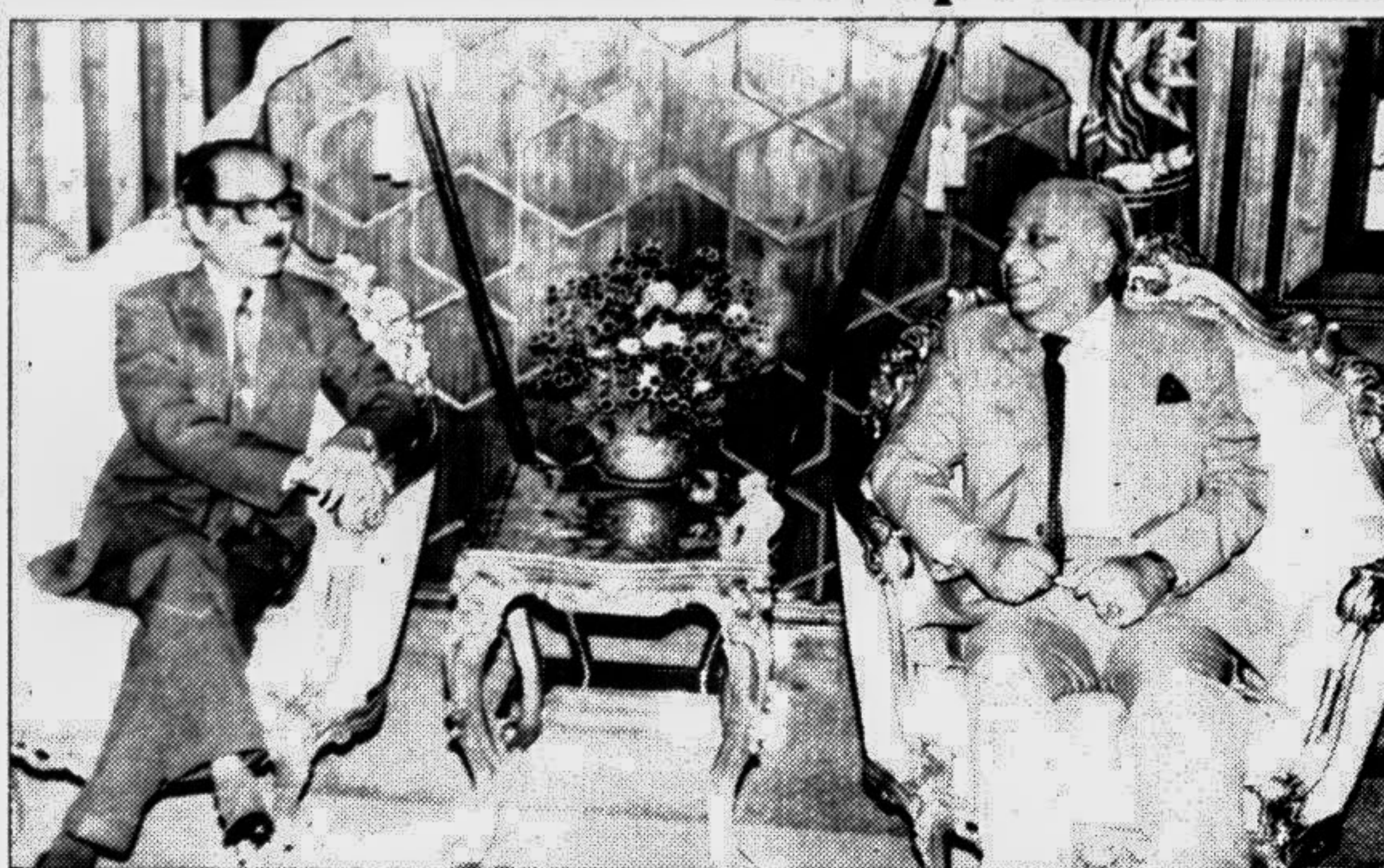
Speaker Humayun Rasheed Chowdhury called on President Justice Shahabuddin Ahmed at Bangabhaban yesterday.

Disclaimer This Key Data Summary is intended to provide prospective investors with an overview of the information in the Prospectus. Investors are advised to examine the Prospectus in full, prior to making an investment decision.