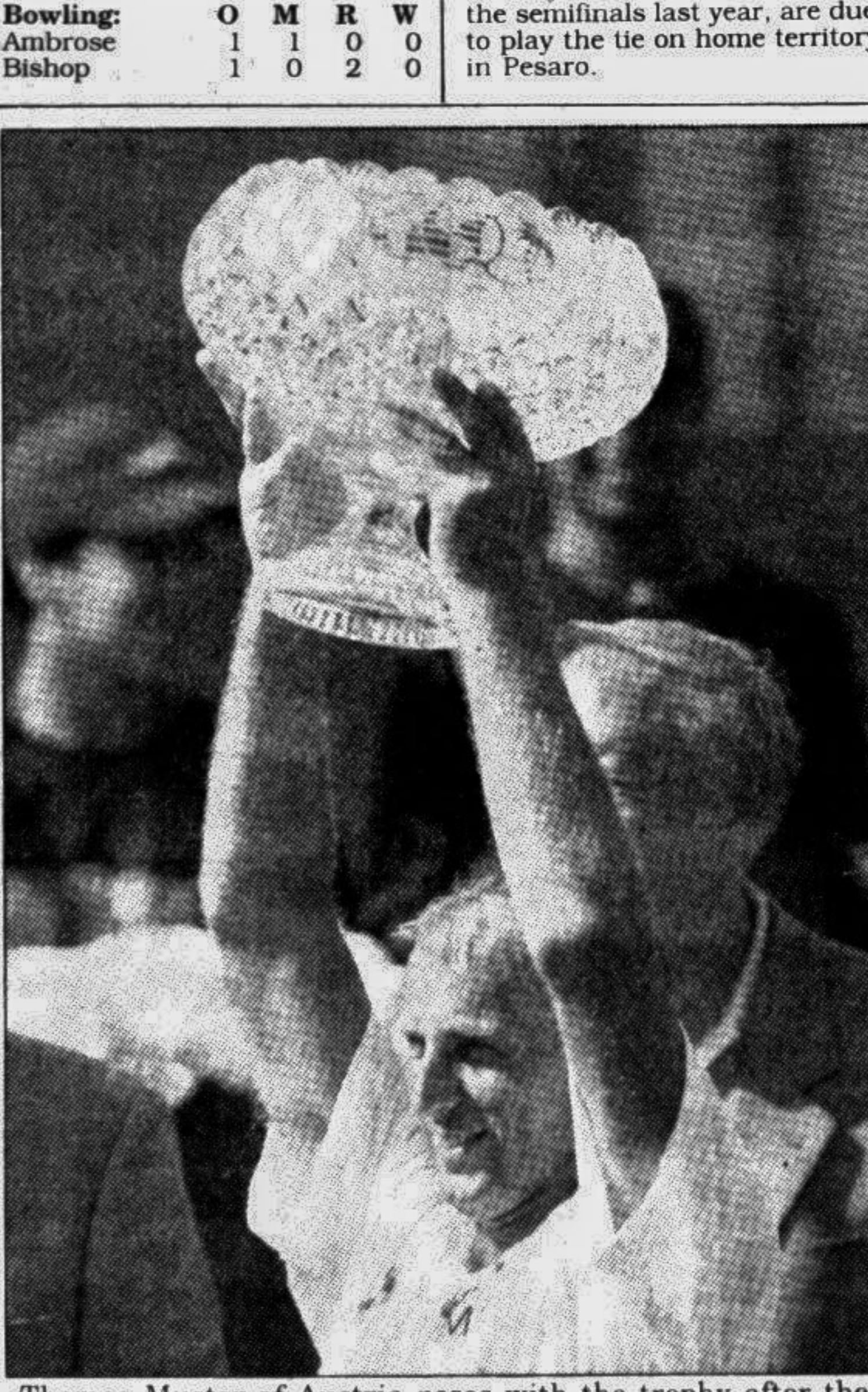
Thomas Muster of Austria poses with the trophy after the Lipton Championships in Key Biscayne, Florida on Mar 30. Muster defeated Spaniard Sergi Bruguera 7-6, 6-3, 6-1 in the final.