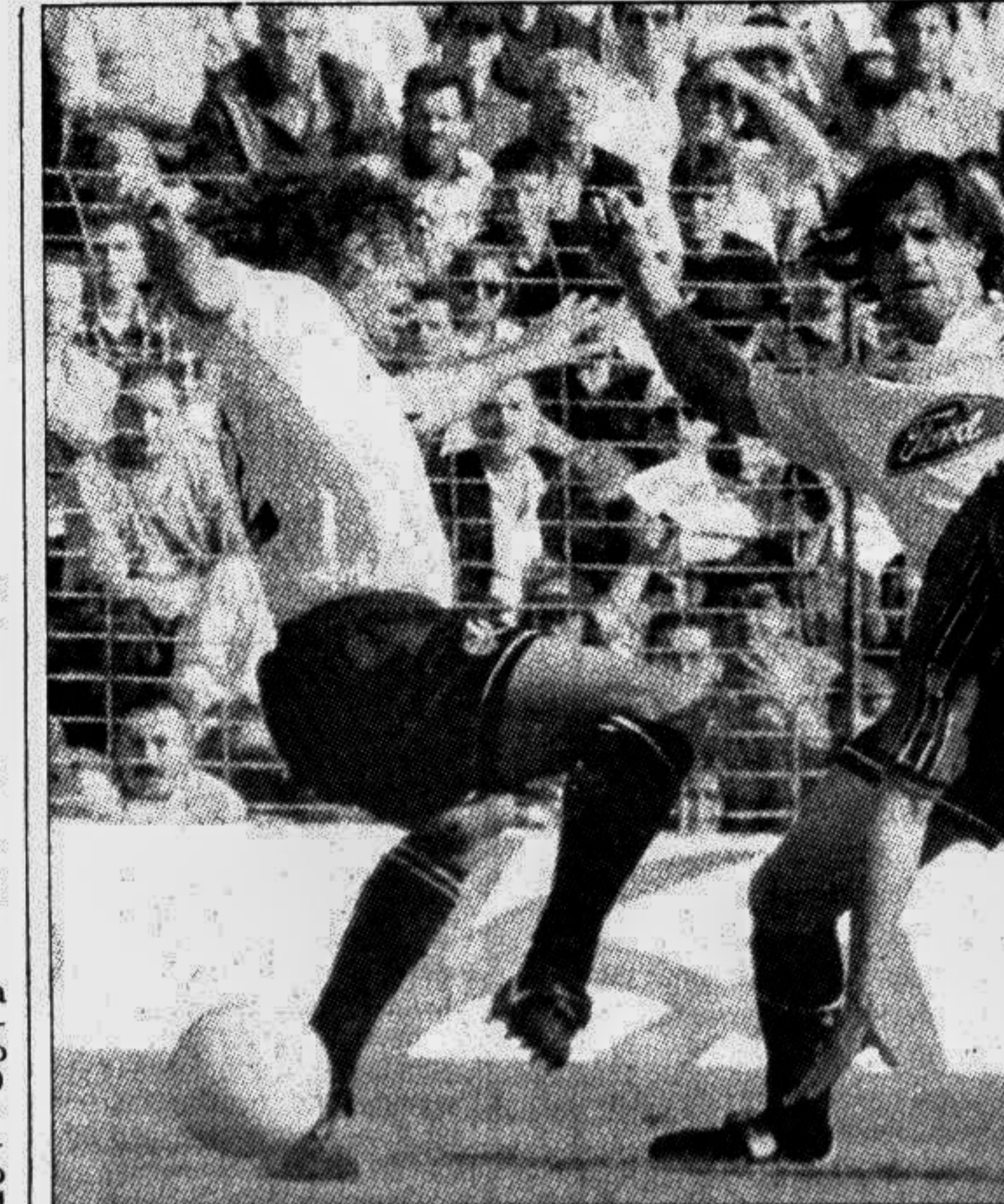
Barcelona's Brazilian star Ronaldo (R) is caught in a tangle between two Valencia players during a Spanish First Division match on Mar 30. The game ended 1-1.

MONICA SELES my life and in my career," she said. "You have to move on. I think I moved on after I came back you take it a day at a time." Seles missed the past four months with a broken finger suffered when she tried to grab a ball served by Martina Hingis After three or four months I was so excited I could play I would reinjure somewhere again. I learned my lessons. That's why I told myself to be more consistent. Hopefully I will (peak) for the French or Wimbledon."