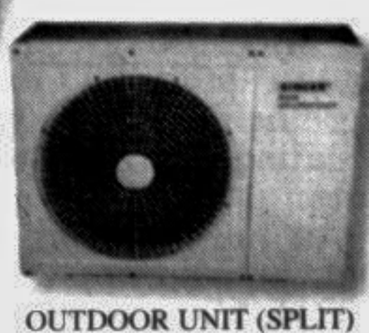
OUTDOOR UNIT (SPLIT)