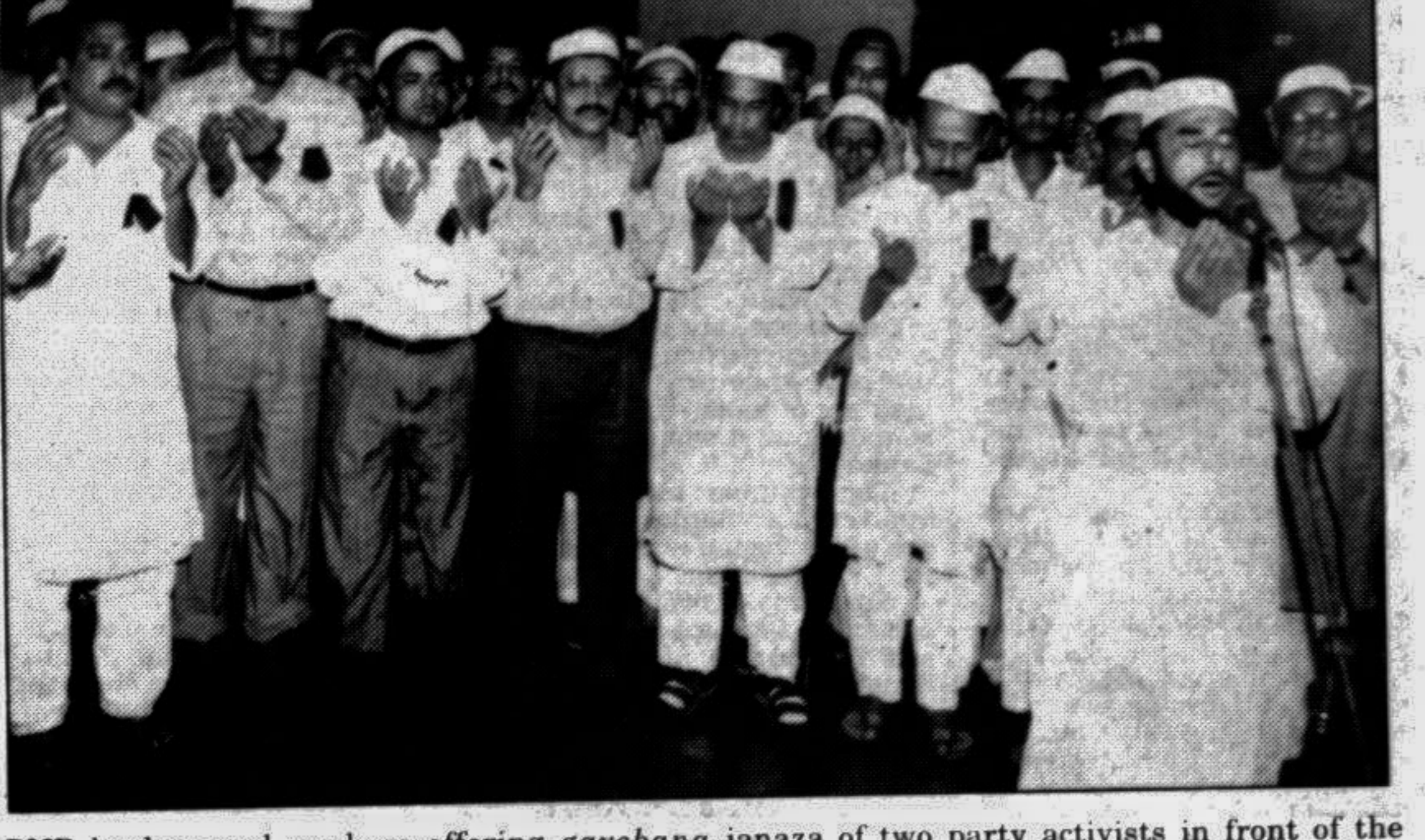
BNP leaders and workers offering gayebana janaza of two party activists in front of the party central office in the city yesterday. The two activists were killed at Feni on Thursday and Saturday last.