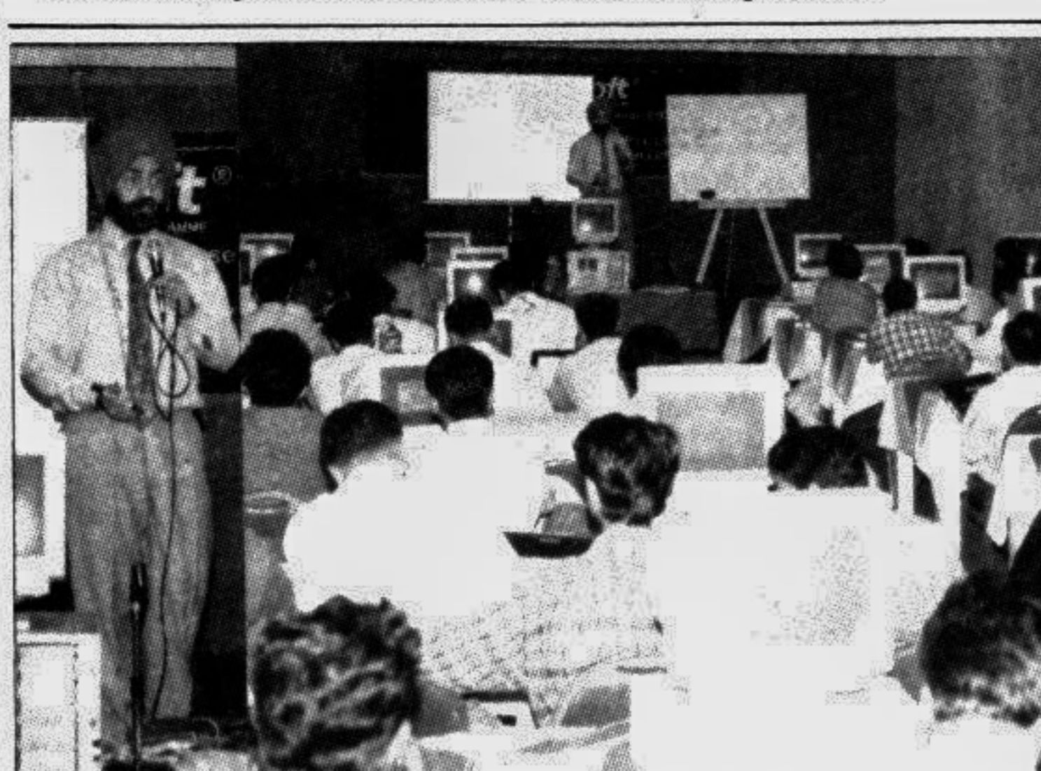
Microsoft Corporation conducted an 11-day training on SQL Server 6.5, Visual Foxpro 3.0 and Windows NT Server 4.0 from March 8 to 18 at a city hotel. The training was organised jointly by Microsoft Corporation India (Pvt) Ltd and Microsoft-authorised distributor in Bangladesh M/s Desktop Computer Connection Ltd. About 160 IT professionals and managers from various organisations including many multinational, NGOs, banks and foreign missions participated in the training programme.