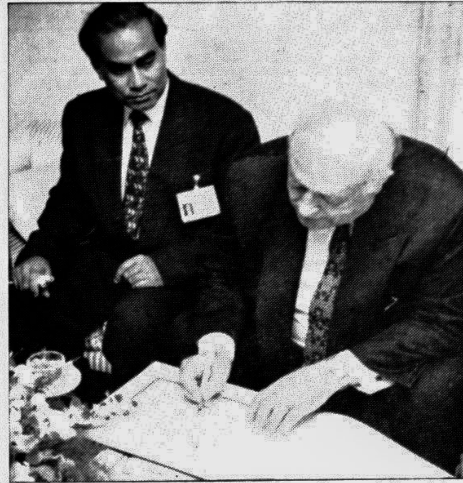
President of Turkey Suleyman Demirel signed the visitors book of Dhaka Sheraton during his stay at the hotel.

The technical committee, among others, will discuss the proposals to be considered by the first meeting of the SAARC tourism ministers schedule to be held in Colombo, next month.