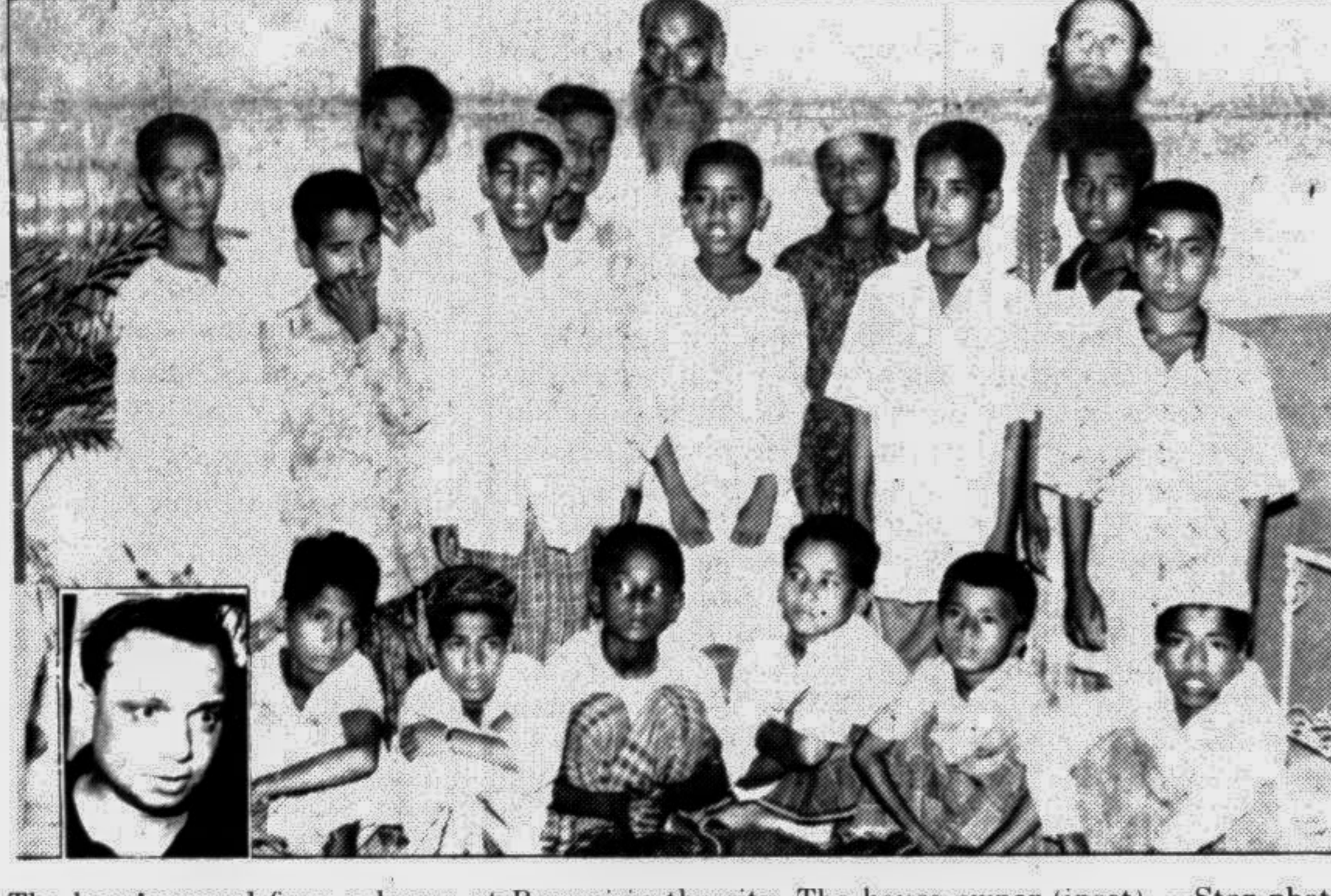
The boys rescued from a house at Banani in the city. The house owner (inset).

By M Anwarul Haq Bangladesh which heads one of the 10 working groups of the proposed D-8 economic bloc is preparing a string of proposals for placement at the next high level meeting of the group comprising eight OIC countries. The proposals are in the sphere of rural development and microcredit. The meeting of the working groups would be held at Istanbul on May 12 and 13 ahead of the summit that would formally launch the organisation in June, according to diplomatic sources. Several model projects in the fields of rural uplift, cooperatives, rural infrastructure and credit disbursement among those not generally considered credit worthy have been proposed. The projects could be taken up for common implementation or replication by the D-8 countries if approved by them, said a senior official of the Foreign Ministry. The proposals for the projects and other recommendations are learnt to have been prepared in consultation with reputed NGOs and different See Page 12 Col 7