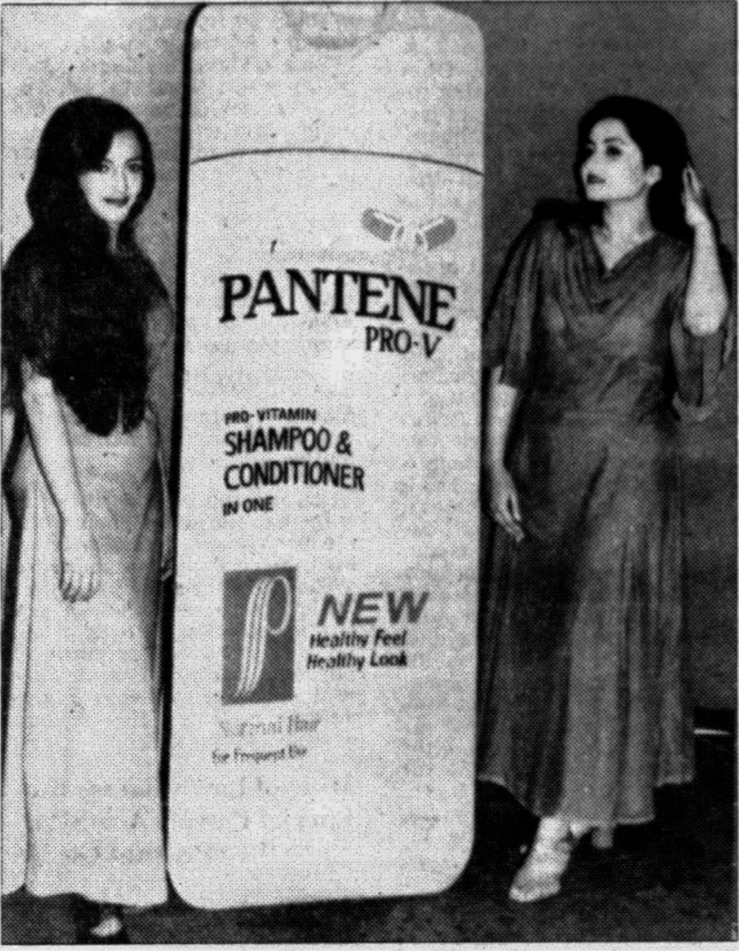
Two brunettes modelling at the launching ceremony of Pantene Pro-V, the world's highest selling shampoo, in the city yesterday.