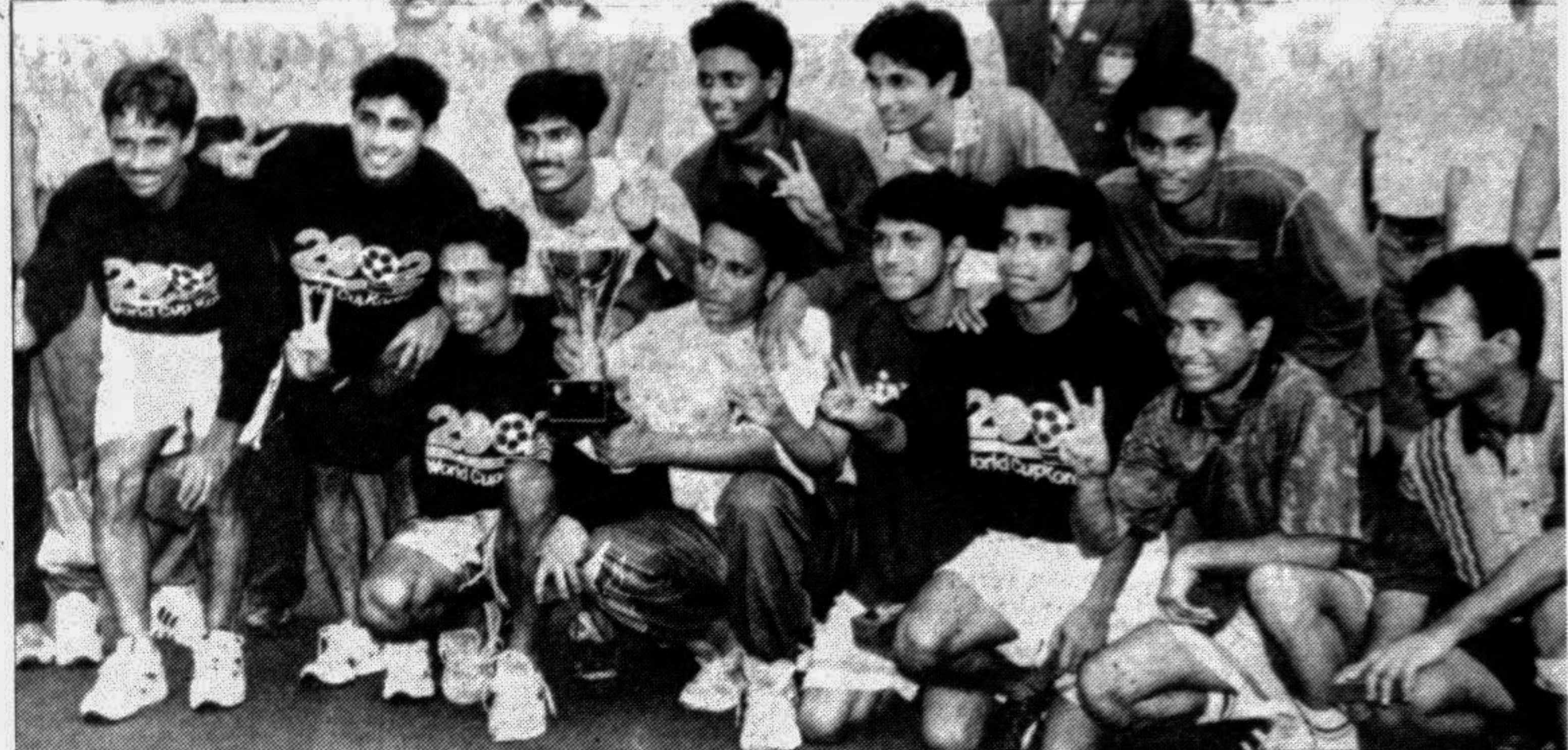
Players of Abahani hockey team, which clinched the Karnaphuli Garden City Club Cup title yesterday defeating arch-rivals Mohammedans in the final.

Due to space constraint our regular item CROSSWORD could not be accommodated. — Sports Editor